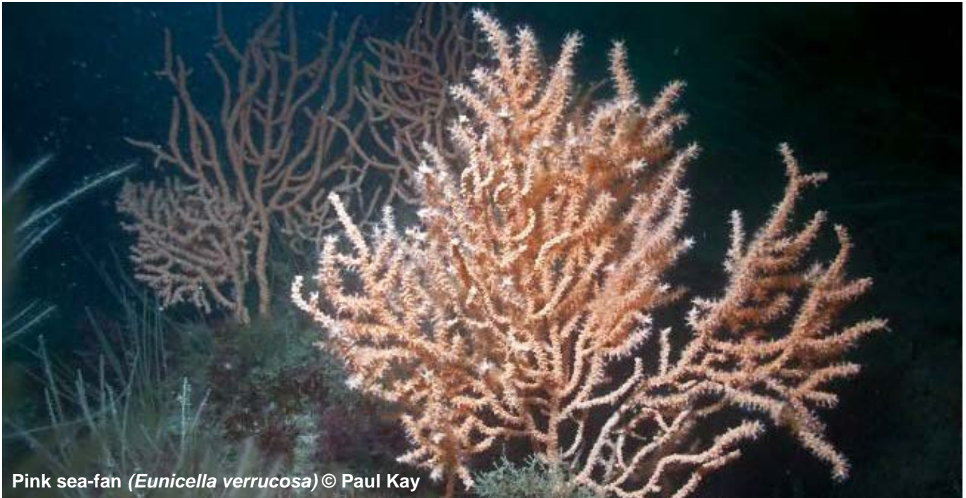
Pink sea-fan ( Eunicella verrucosa )