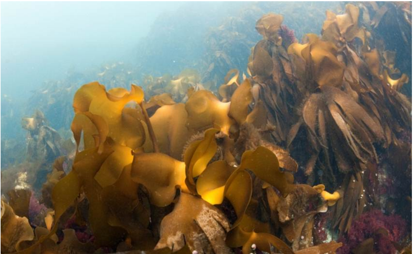
High energy infralittoral rock: Shallow water rock, below the tides, exposed to very strong waves and currents

Management in MCZs can take several different forms, from using existing licensing framework, specific byelaws and orders or an EU Regulation for a site. There has to be public consultation on permanent byelaws and orders. For activities that already need a marine licence, regulators consider the MCZ in their decision as soon as the site is consulted on. Find out more about marine licensing in MCZs at https://www.gov.uk/government/publications/marine-conservation-zones-mczs-and-marine-licensing .