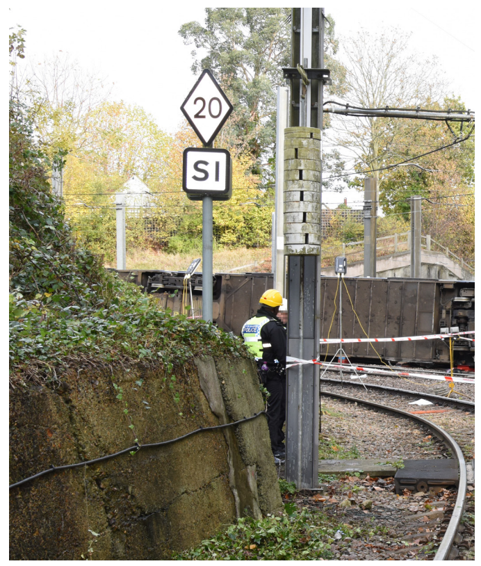
Figure 3: Speed restriction sign. The legend 'SI' under the speed figure indicates the location of a section isolator, an insulated joint in the overhead electrical power line