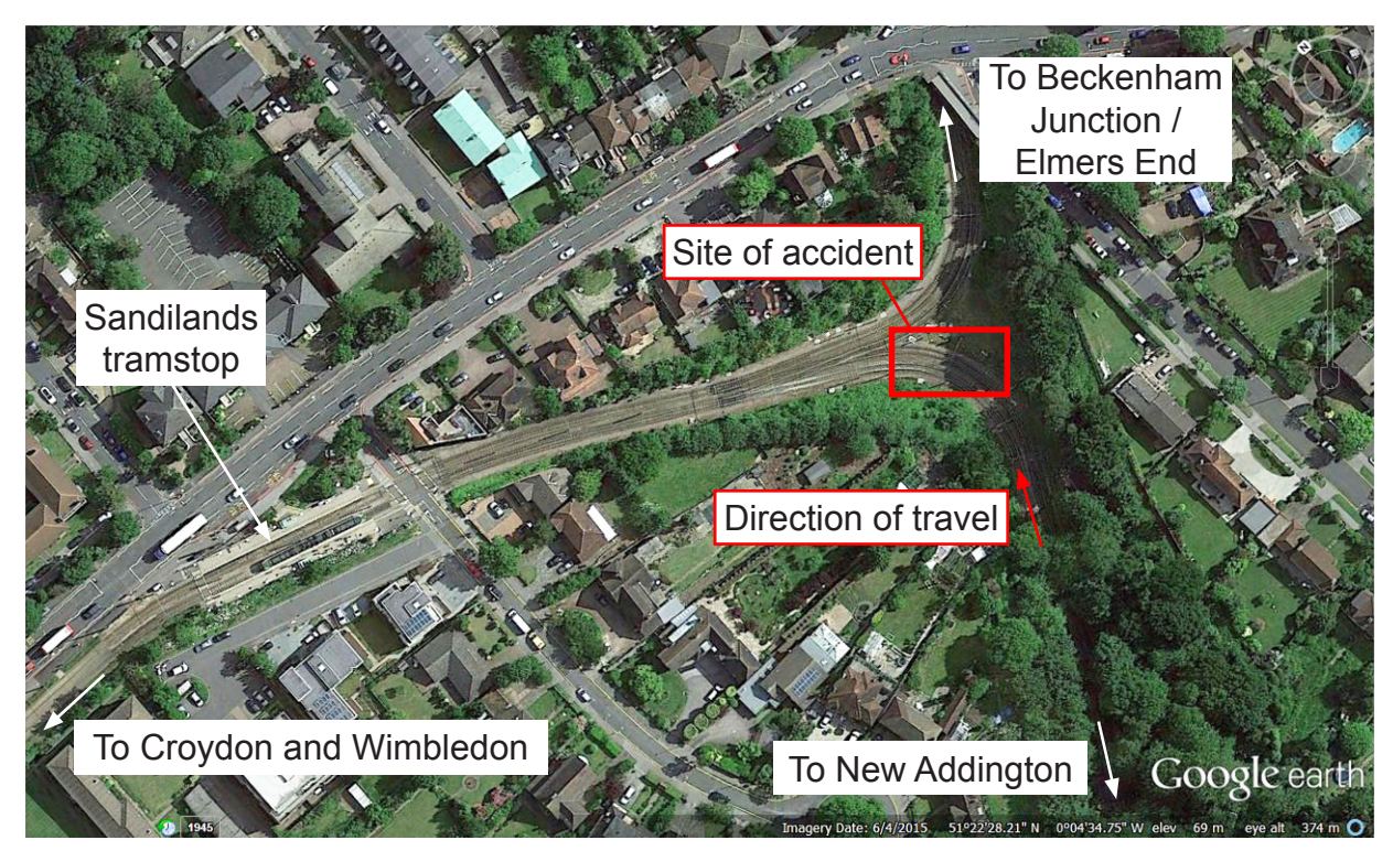
Figure 1: Google Earth image showing area where accident occurred