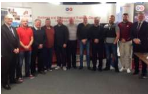
Ex-SSI steel workers starting ECITB Supervisor Training