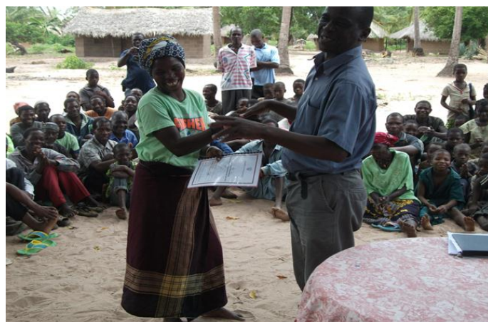
Figure 5: Women receiving their state-granted land rights from National Advisory Council members, Mozambique

The evaluation demonstrated that while the project was excellent at preparing communities and empowering them, it was less good at organising producer organisations and encouraging investment. It also found relative strengths in the two project approaches, with the DFID supported project strong at building greater community ownerships, while the Millennium Challenge Account project was stronger at building local government capacity to ensure speedier processing of land rights. The evaluation has provided a highly useful input into the design for the next phase of support to land tenure security in Mozambique.