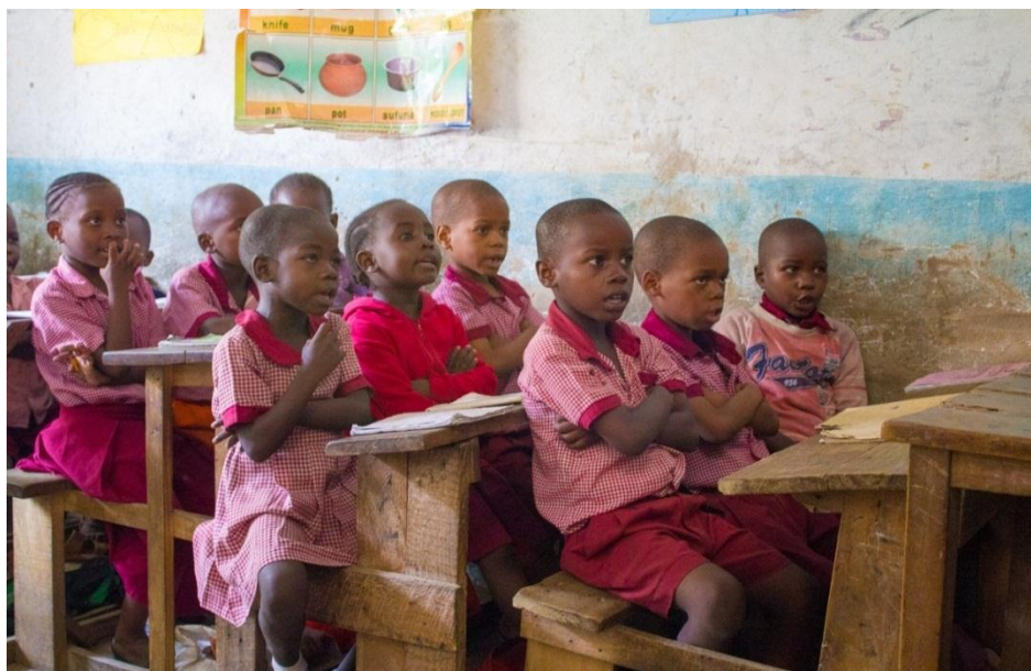
Figure 6: Students in a numeracy class, Girls Education Challenge Fund Kenya

GEC evaluations are asking questions on gender issues in education, including which barriers to education are gendered, and which directly or indirectly impact enrolment, attendance and learning, or any combination of these outcomes. This has important programme design implications for DFID and partners working on girls' education.