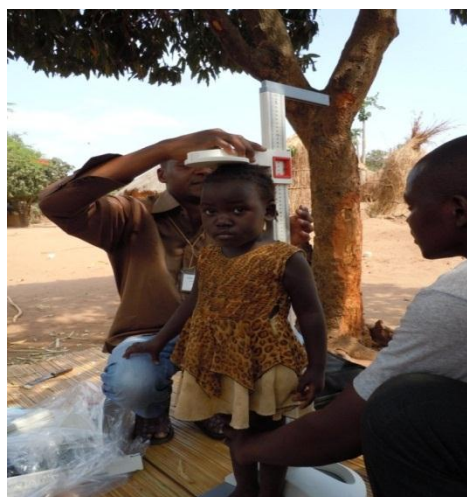
Figure 1: Evaluation of the Social Cash Transfer Programme – measurement of child growth rates, Kaputa, Zambia

The 2013 budget speech described the increased allocation as a shift from “poorly-targeted subsidy programmes...” to “better designed social protection programmes ...that have been successfully piloted”. 2 The Zambia Vice President described the scale up of the cash transfer programme as an example of evidence-based policy making.