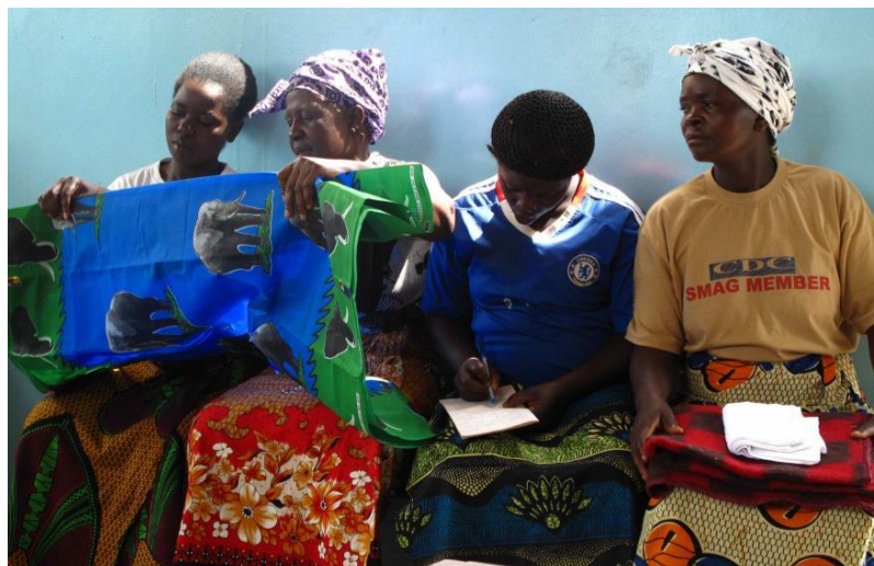
Figure 4: Expectant mothers receiving "Mama Kits", Zambia

The success of the programme lies in the actions that the ministries are taking as a result of evaluation findings, e.g. scale up, refine or discontinue. In response to the Mama Kit evaluation results, the Zambian Ministry of Community Development, Mother and Child Health scaled up the use of Mama Kits . In 2014 the Ministry drafted an operational plan and secured international funding for wider implementation of the programme.