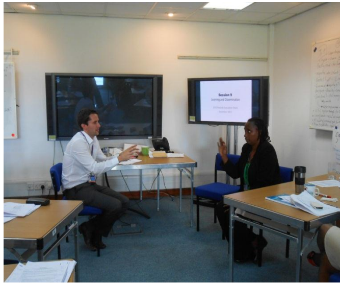
Figure 10: Principles of Evaluation Training Course, DFID Rwanda, December 2013

The Principles of Evaluation training courses have attracted a mixture of international and locally employed DFID staff working in both programme management and advisory roles. Participants in the most recent course run in Rwanda found this practical approach using their own case studies helpful. Eight courses were run in 2013-14 reaching 145 participants – three in Africa, three in Asia and two in the UK.