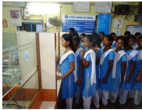
Figure 3: Scholarship girls withdrawing funds from their bank accounts