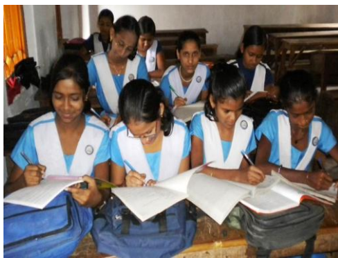
Figure 2: Scholarship girls in their classroom, India