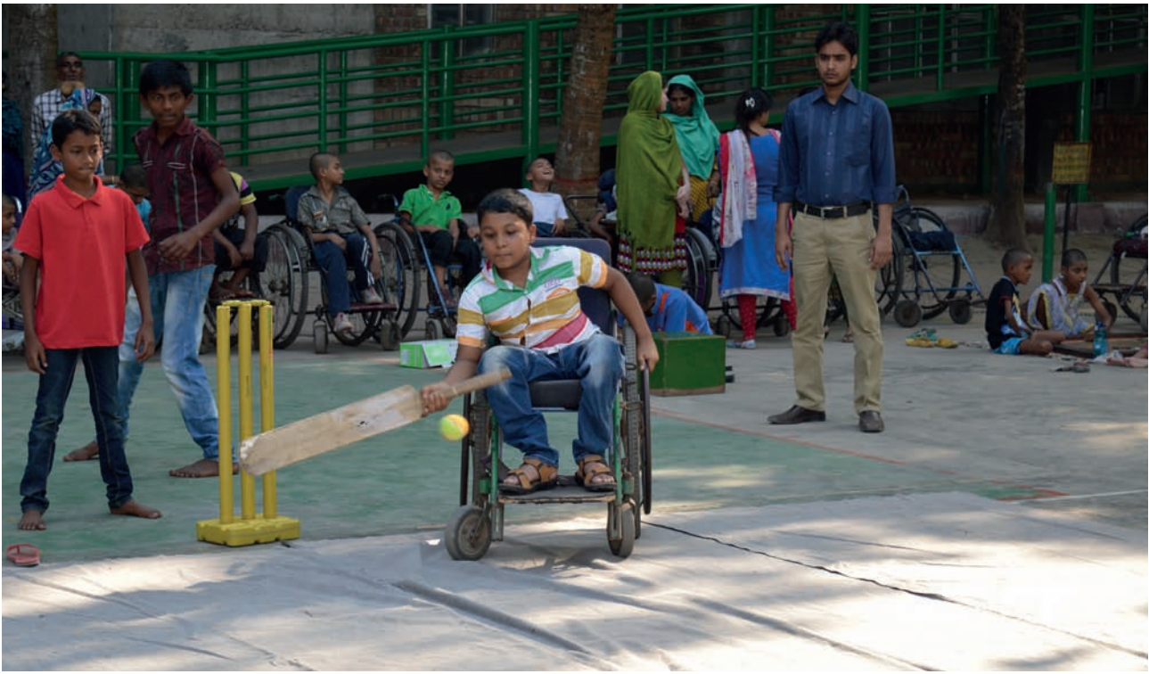
An IN cricket project in Bangladesh