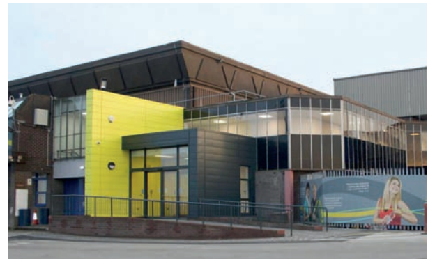
The East Midlands, London and Sheffield sites of the National Centre for Sport and Exercise Medicine