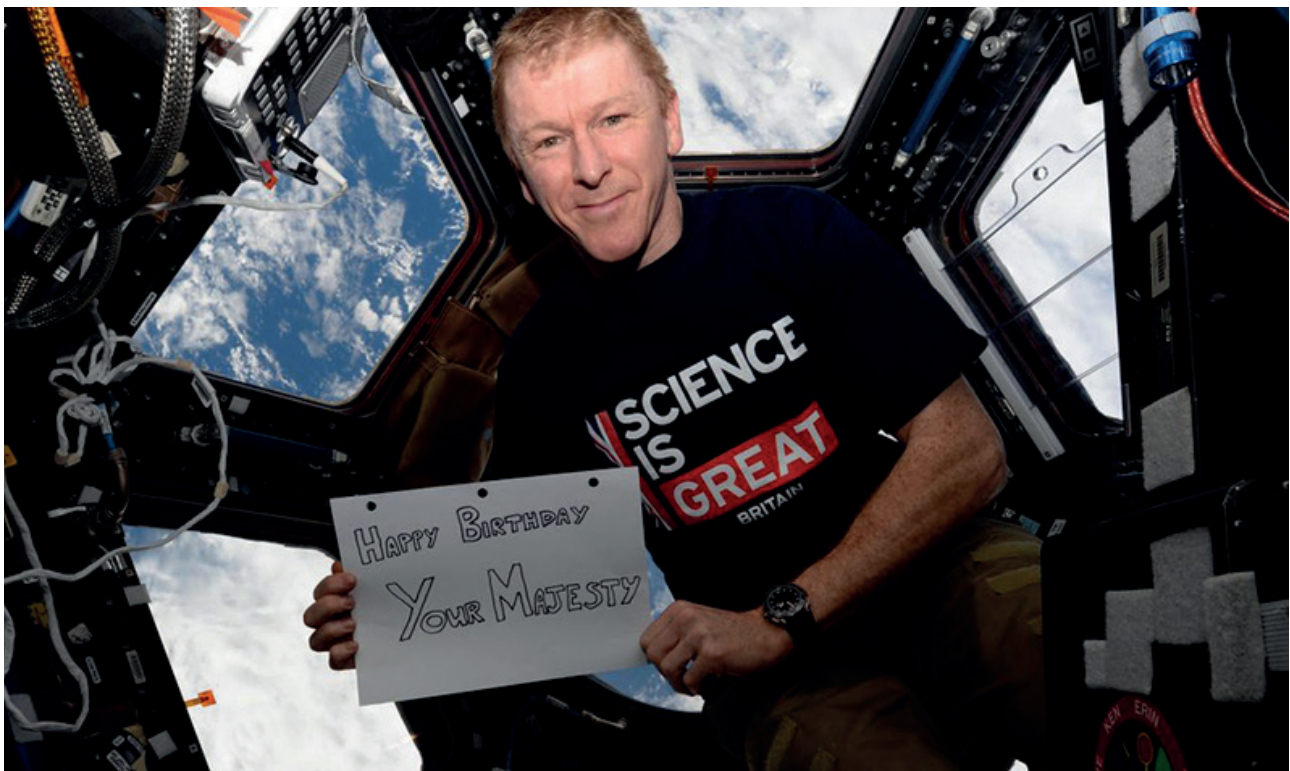
British astronaut Tim Peake congratulates Her Majesty the Queen on her 90th birthday from the International Space Station