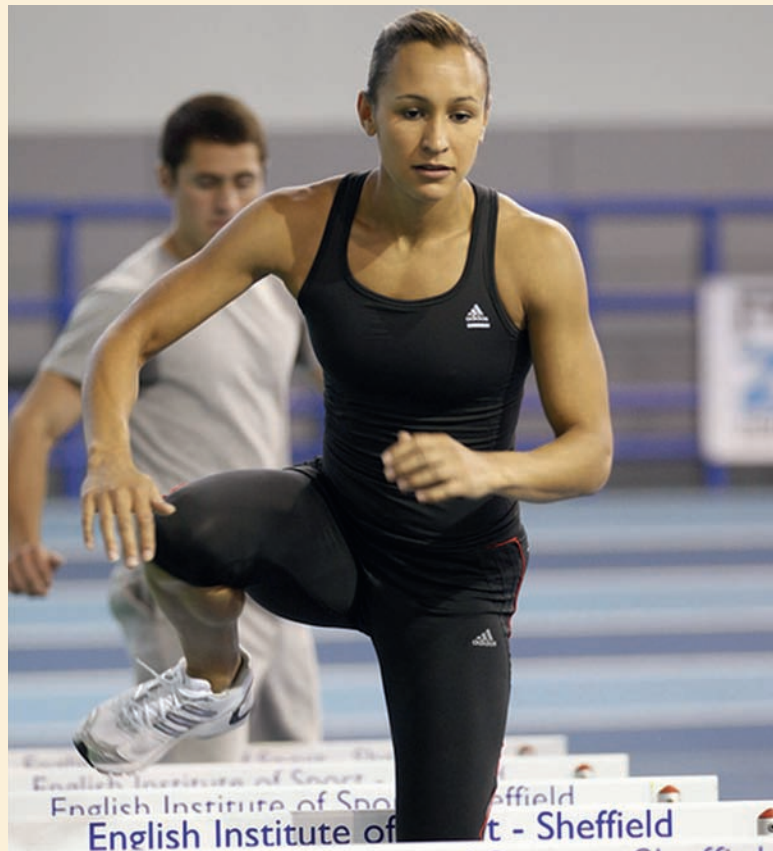
Jessica Ennis-Hill training at the English Institute for Sport Sheffield

When fully operational in 2018 up to 3,000 athletes, teams, students and researchers will use the Park every day, and at night it will be the location for professional rugby and basketball with up to 5,000 spectators.