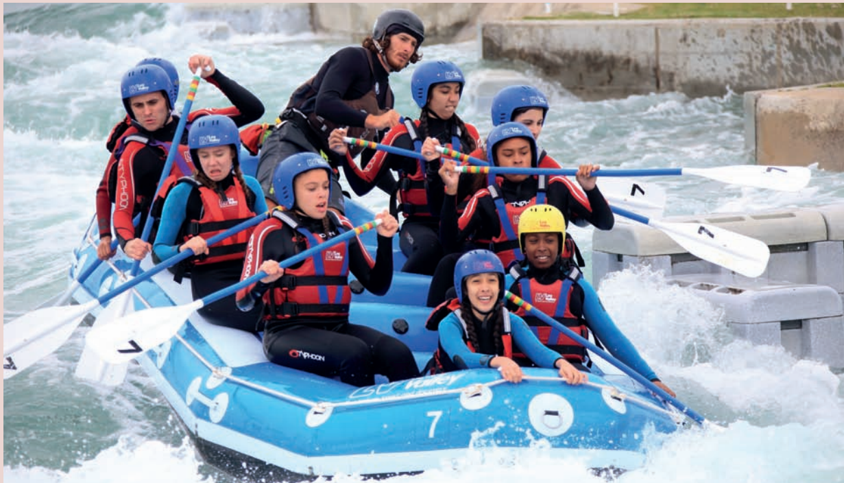
Lee Valley White Water Centre

Income raised from commercial activities has already resulted in a number of community initiatives designed to increase participation from key target groups. These include female only paddle sports development programmes, a Black and Minority Ethnic programme and a schools outreach programme.