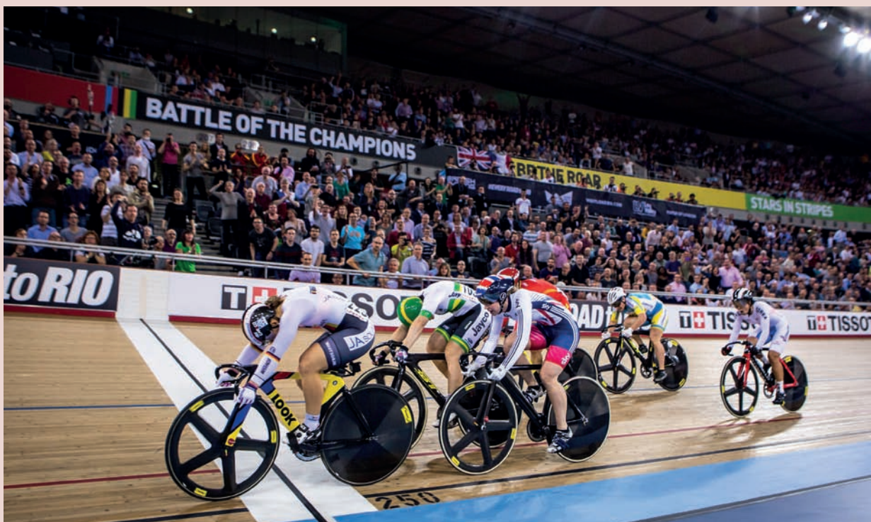
The velodrome at Lee Valley VeloPark

Ten major events have been held at the venue attracting more than 150,000 spectators. These include the UCI Track Cycling World Championships in March 2016; Revolution Series, Britain's top track cycling competition, in March and October 2014 and November 2015; and Sir Bradley Wiggins' one hour world record in June 2015.