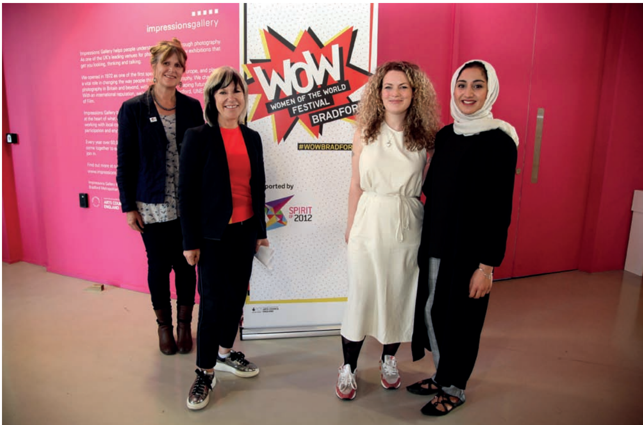
Spirit of 2012 and the Southbank Centre have launched a three-year partnership to deliver Women of the World (WOW) festivals in new locations across the UK