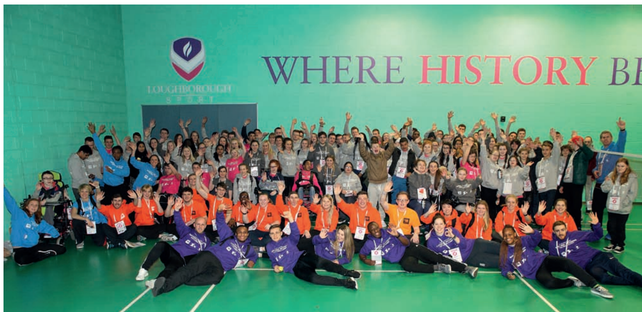
Spirit of 2012 funds Inclusive Futures, a pioneering, youth-focused, inclusive leadership and volunteering initiative delivered by the Youth Sport Trust in nine host cities across the UK