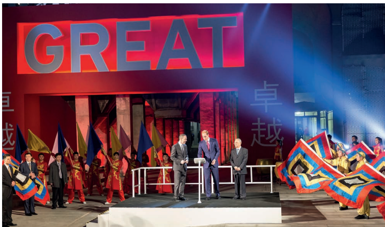
HRH Duke of Cambridge opens the GREAT Festival of Creativity, Shanghai March 2015