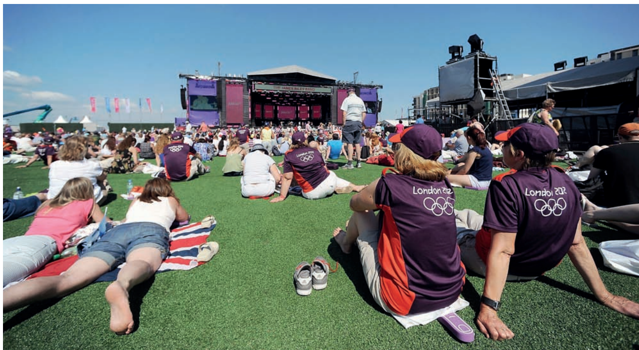
Go Local, the Join In and Mayor of London event for Games volunteers in 2013 on Queen Elizabeth Olympic Park