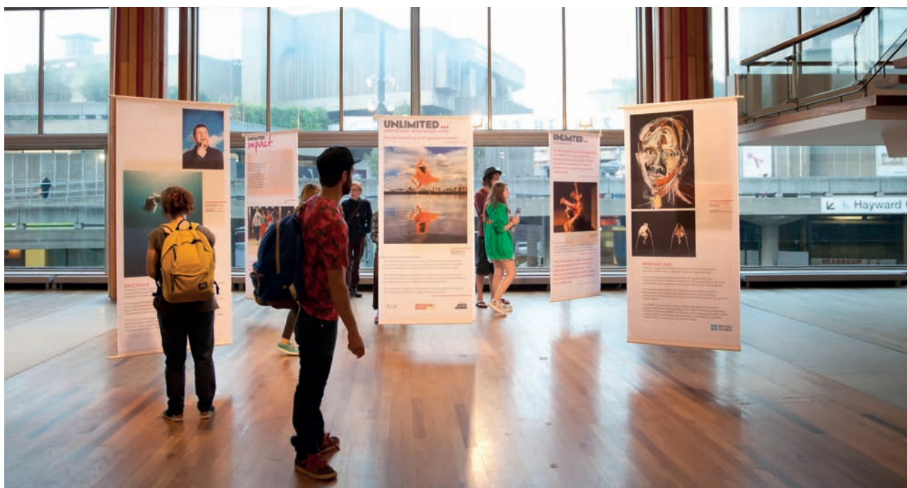
The Unlimited Festival at Southbank, London