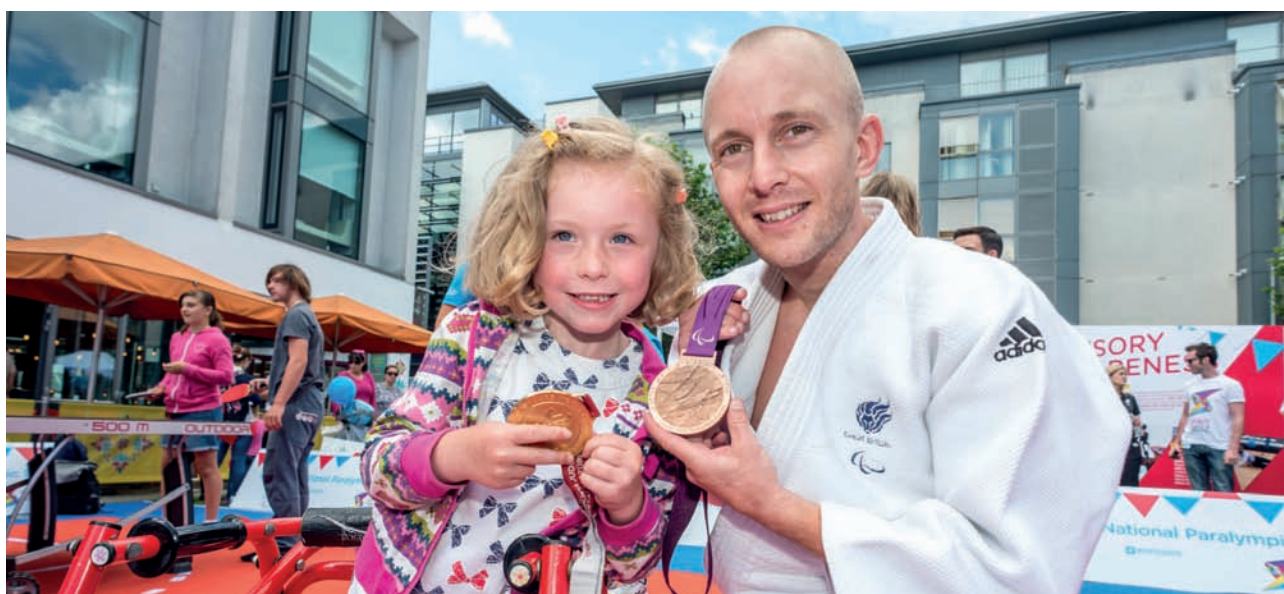
National Paralympic Day 2015 in Brighton