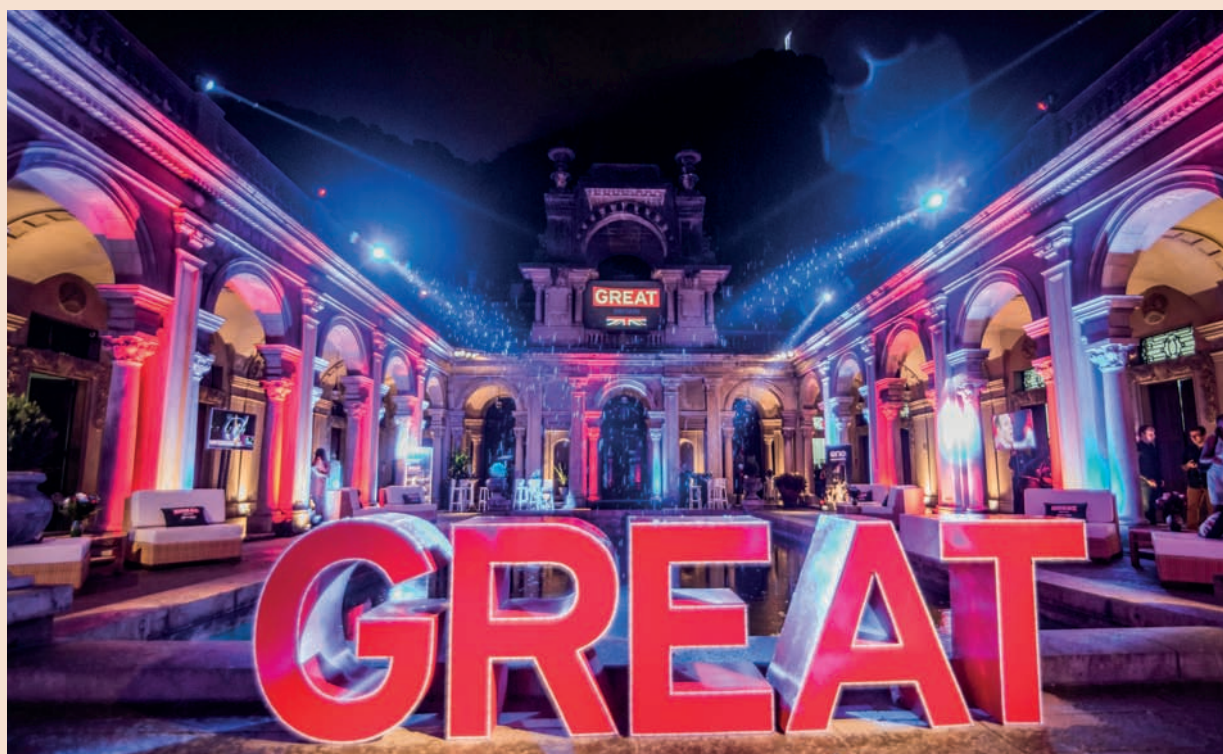
The UK government's Olympic British House, which will be delivered in partnership with the British Olympic Association and the Mayor of London, is in one of Rio's leading cultural venues. The venue has already been used for smaller events, such as the 'One year to go' celebration in 2015.

As part of a wide programme of business and cultural events, the British House during the Olympics and Paralympic Games will showcase UK expertise in delivering major sporting events from London to Rio and onwards to future hosts – in collaboration with other FCO and UKTI posts around the world, such as Tokyo, South Korea, Qatar and Russia.