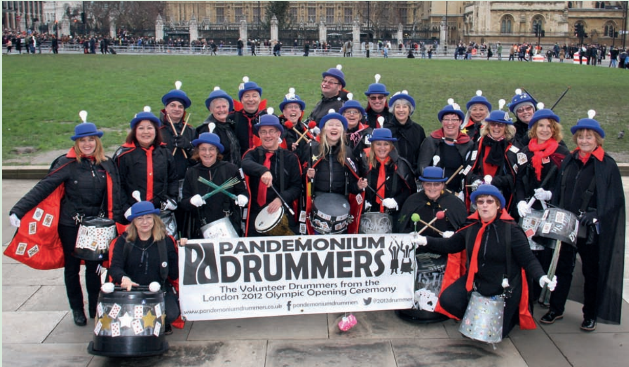
The Pandemonium Drummers

The PDs have performed and cheer-drummed at over 150 diverse, large and small, indoor and outdoor, charity and community events, arts festivals and parades. Requests come via the Pandemonium Drummers' website which links to the PD YouTube channel.