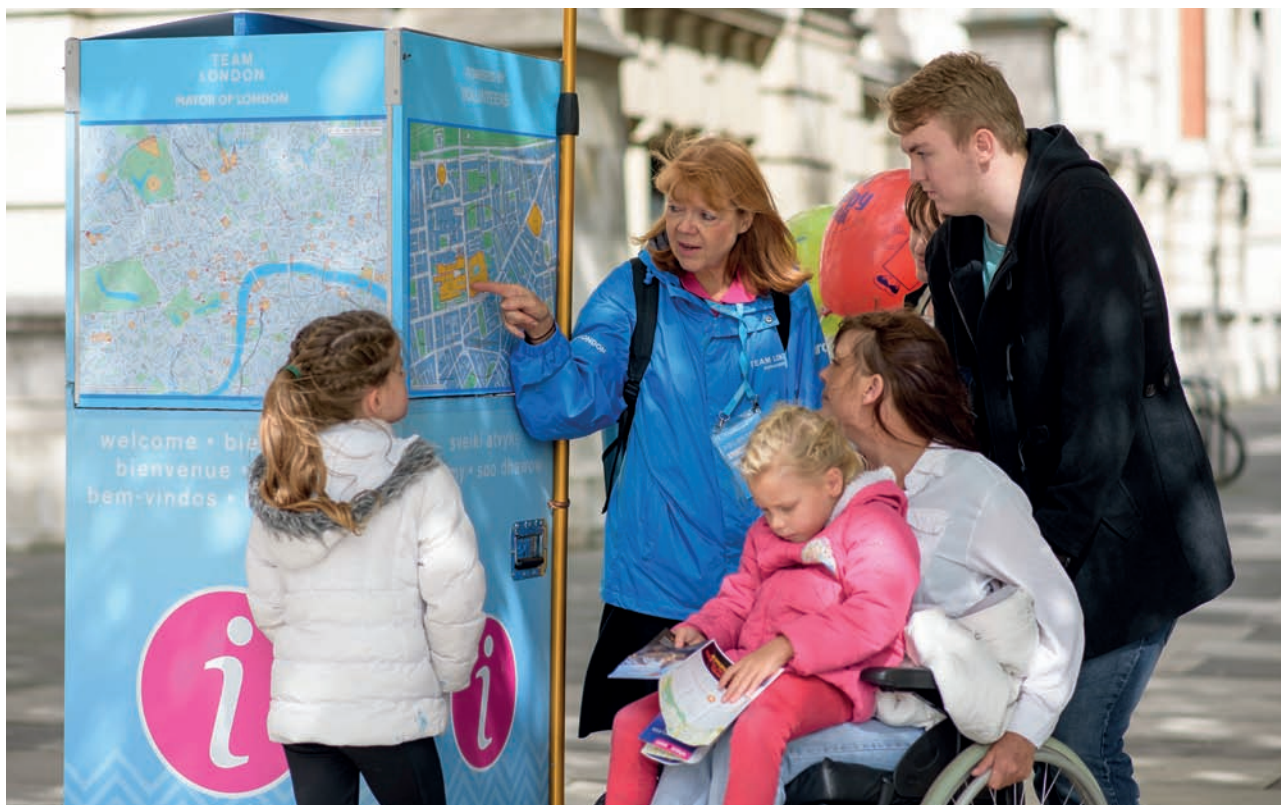
Team London Ambassadors on Exhibition Road in London