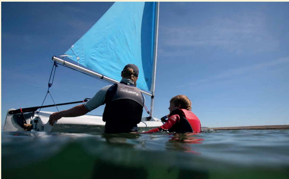
Learning to sail