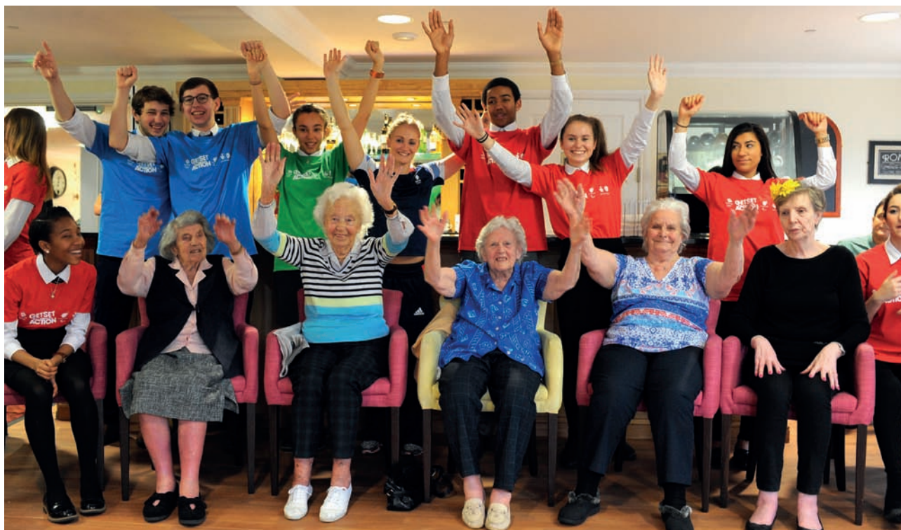
Get Set for Community Action