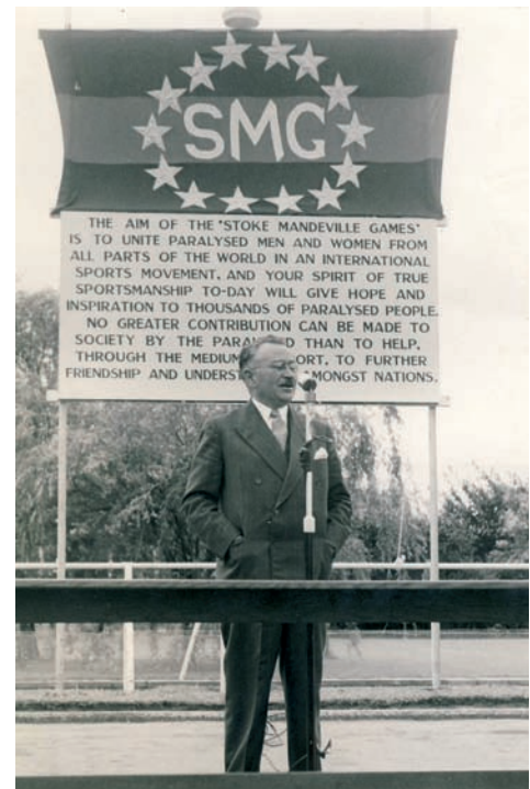
Sir Ludwig Guttman speaking at the Stoke Mandeville Games in 1953