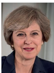
Rt Hon Theresa May MP Prime Minister

London 2012 was an extraordinary moment in our country's recent history. Like many people I will never forget the excitement of watching the world's best athletes perform here on our shores, and the wonderful spirit of national pride we felt during those weeks.