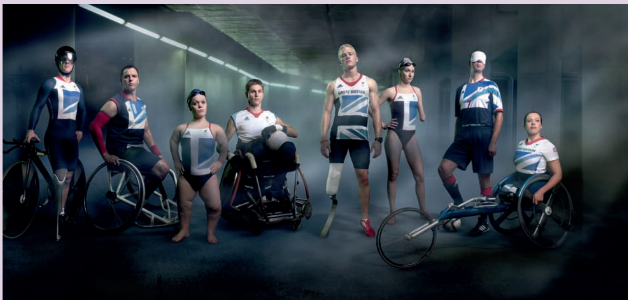
Channel 4's campaign for London 2012: Meet the Superhumans

Channel 4's approach to Paralympic coverage is part of its remit as a public service broadcaster to reflect the diversity of the UK, challenge established viewpoints and inspire change in people's lives. Almost 40 million people watched Channel 4's coverage of the London 2012 Paralympic Games (a 251% increase compared to the 2008 Beijing Paralympics). The multi-award winning coverage and marketing campaign, showcasing the Superhuman athletes, saw disability portrayed as never before.