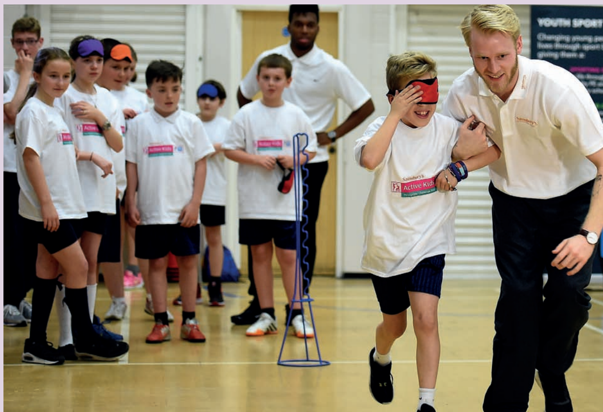
Active Kids ambassadors Jonnie Peacock (far right) and Daniel Sturridge (third from right) helping with the Active Kids Paralympic Challenge

The challenges have been developed to maximise learning outcomes in relation to the national curriculum programme of study, targeting Key Stage 1-3, and will support the objectives of the government's Primary PE and Sport Premium.