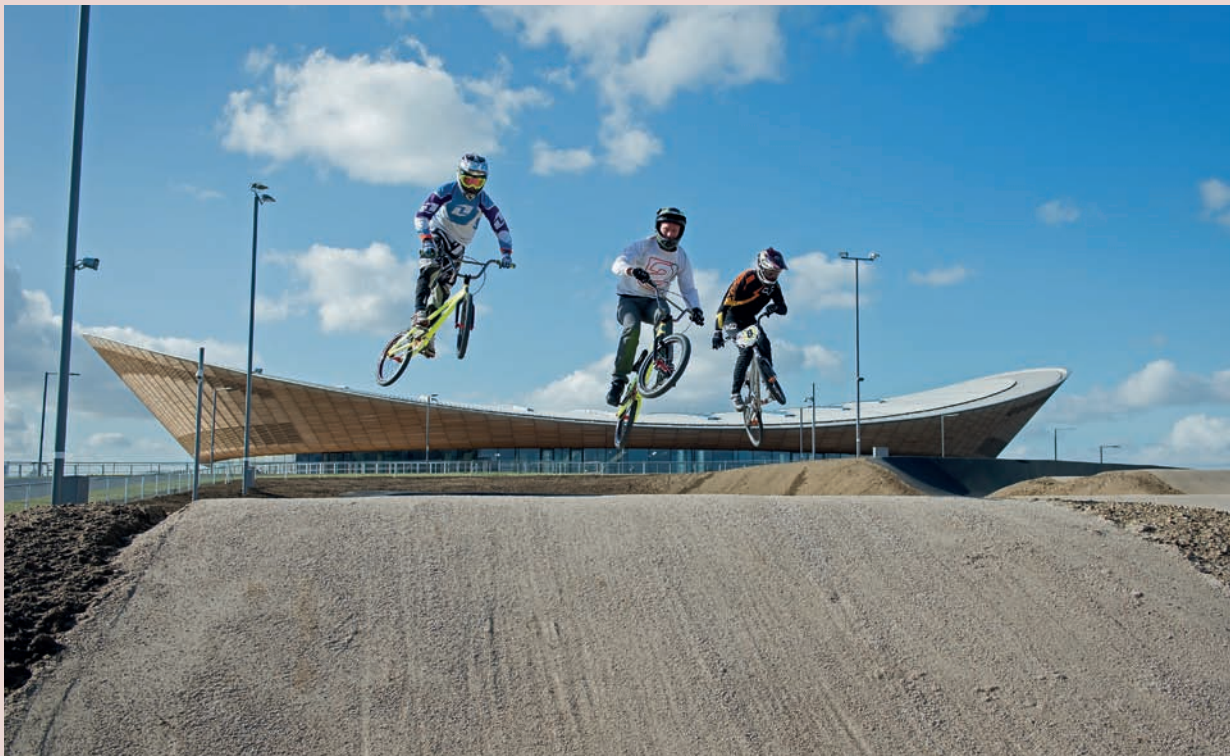
BMX at the Lee Valley VeloPark

The venue is hugely popular with major companies for initiatives such as team building days, a key revenue stream. 300 such events have been held. Other commercial initiatives include a deal with major UK bike retailer Cycle Surgery, which is the venue's Official Cycle Sports Retailer and runs a shop there.