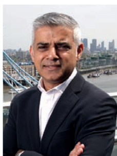
Sadiq Khan Mayor of London

The summer of 2012 was a unifying moment for London and the UK as a whole. We came together in a shared experience. We watched together as Mo Farah, Jessica Ennis-Hill, Sarah Storey and many others achieved wonderful feats of sporting excellence. And together we welcomed competitors and visitors from across the globe.