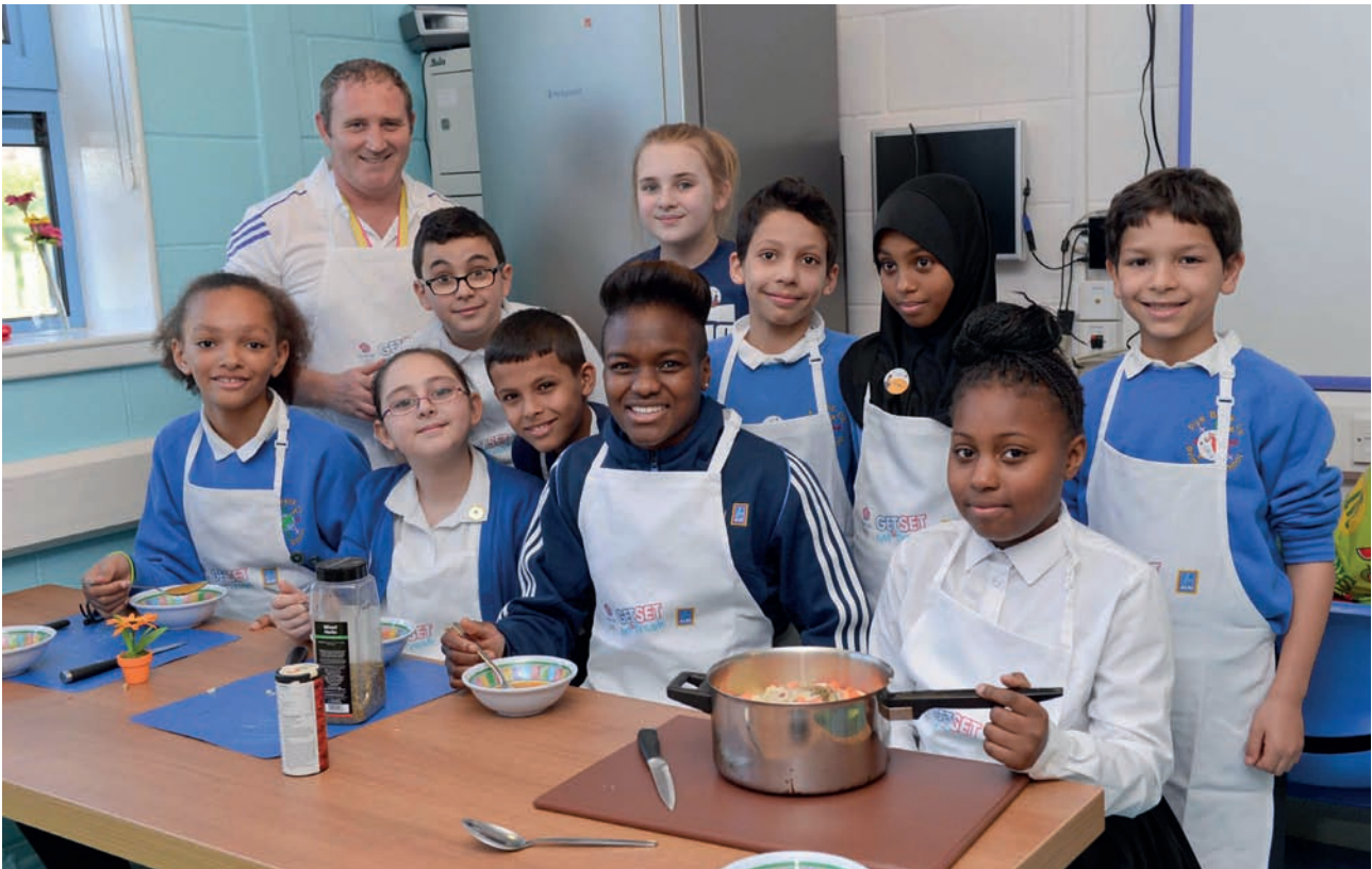
Olympic boxing champion Nicola Adams visited Pye Bank C of E Primary School in Sheffield as part of “Get Set to Eat Fresh”