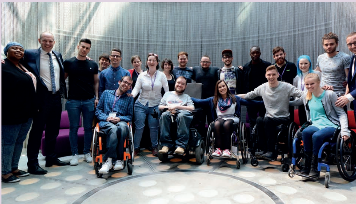
Channel 4's Rio Production Trainee Scheme, supporting disabled talent behind the camera

2016 is Channel 4's Year of Disability, with initiatives to support the development of disabled talent sitting alongside the thirty activities outlined in the Charter. These include plans to double the number of disabled people in Channel 4's biggest shows, progress the careers of disabled people working in their biggest suppliers, and ring-fence apprenticeships and work experience opportunities for disabled people.