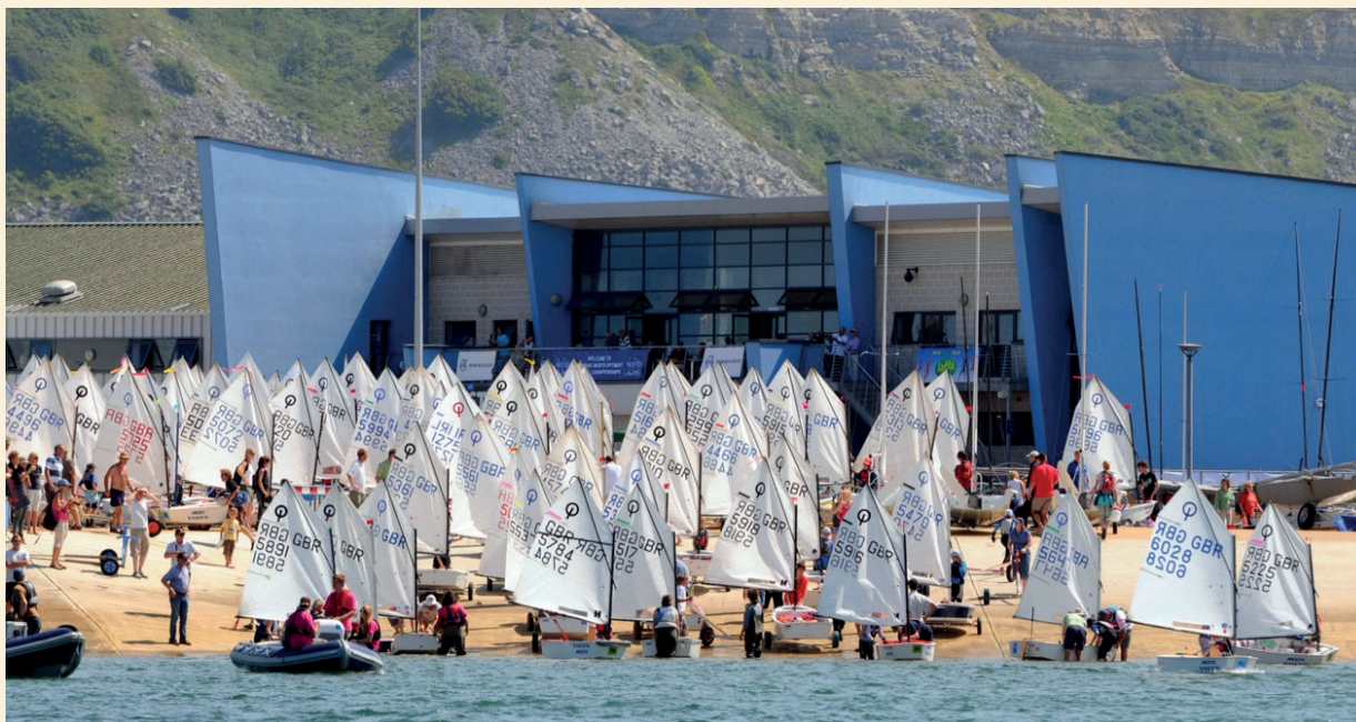
Weymouth and Portland National Sailing Academy

Sail for Gold, the annual international Olympic and Paralympic Class regatta that was held for a number of years pre-2012, has continued annually and from 2015 became one of two European legs of the Sailing World Cup.