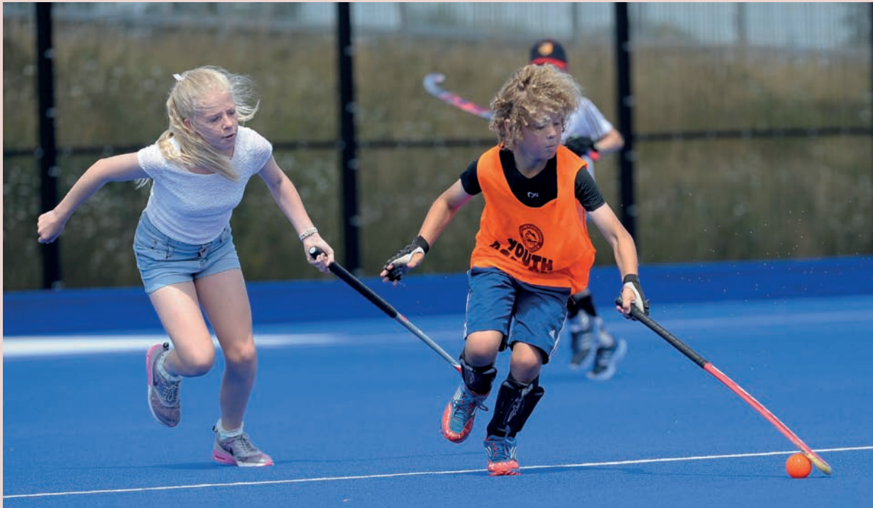
Lee Valley Hockey and Tennis Centre

During peak times 90% of the tennis courts are fully booked while special learn to play tennis programmes are held each day and throughout the school holidays. The venue has become the “Wembley” of English hockey, with national finals for players of all ages taking place there as well as high profile, international competitions that attract some of the world’s best teams.