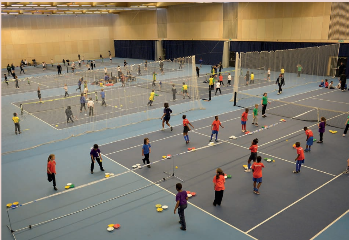
Lee Valley Hockey and Tennis Centre

Tennis programmes at the venue are designed to broaden the appeal of the sport. They include learning disabilities tennis sessions, wheelchair tennis sessions, tennis activities aimed at over 50s, school holiday tennis camps and free tennis coaching to local schools and community groups funded in partnership with the Lawn Tennis Association's charity, the Tennis Foundation.