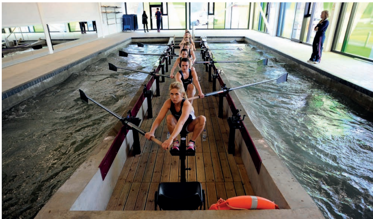
Durham University – a recipient of Sport England's Iconic and Strategic Facilities funds