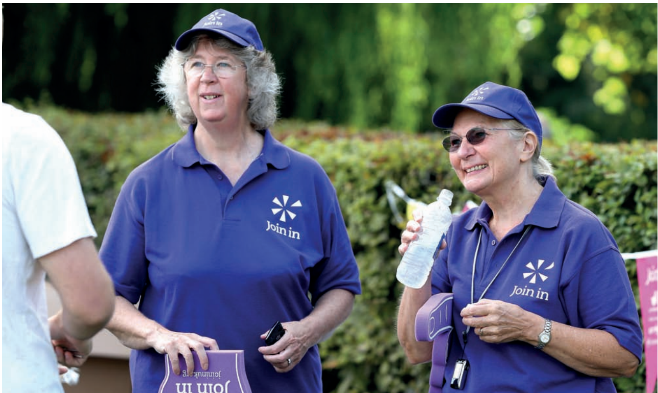
Join In Local Leaders