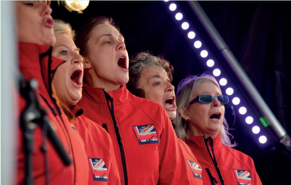
The Games Maker Choir

With an established musical director, regular rehearsals and some serious hard work, the choir gets many requests to perform around the country. In the last twelve months the choir has performed at the European Hockey Championships, twice for Rugby World Cup 2015, and back at Queen Elizabeth Olympic Park for Sport Relief 2016. It is fast becoming “the choir for sport” and is in high demand.