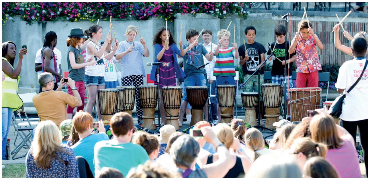
Our Big Gig in Bristol, 2014