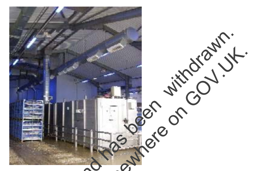
Diagram 5: Birds in a covered lairage building (with gas stun-killing equipment alongside)

3.1 Operators of slaughterhouses must provide a suitable, covered lairage, where birds can temporarily be accommodated when they arrive (see diagram 5).