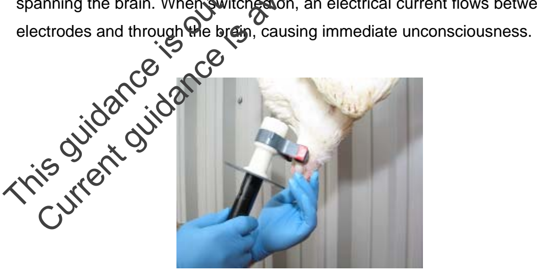
Diagram 14: Head-only stunning of a broiler showing the electrode position on the bird's head.

The electrodes must be placed on each side of the bird's head, spanning the brain. When switches on, an electrical current flows between the