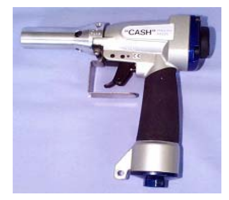
Diagram 18 : AIR POWERED CASH POULTRY KILLER – Manufactured by Accept 8 Shelvoke Limited

The CASH killer is available in two different models: