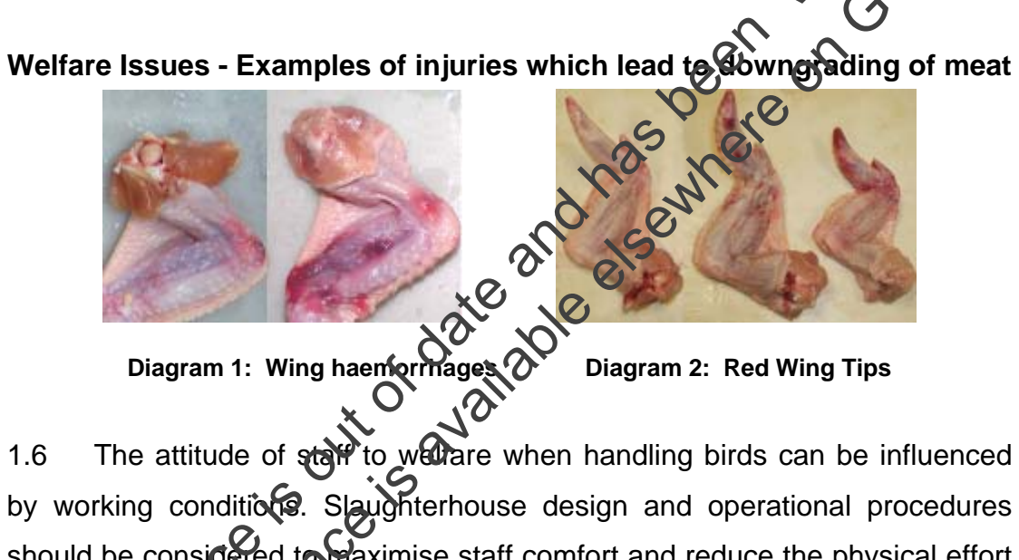
Diagram 2: Red Wing Tips

to ware when handling birds can be influenced 1.6 The attitude of staff by working conditions. Slaughterhouse design and operational procedures should be considered to maximise staff comfort and reduce the physical effort perconnel handling poultry. Adequate covered when accommodation should be provided for the birds awaiting slaughter or killing which is well entilated, draught-free, dry and hygienic. This will enhance the environment for both the birds and staff and will result in better bird welfare, carcase and meat quality and productivity.