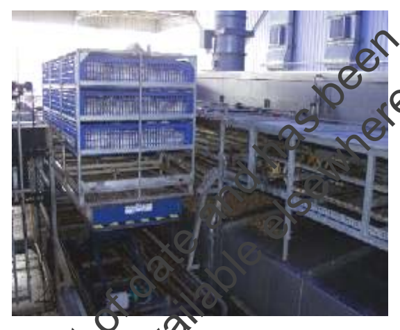
Diagram 15: Crates being loaded into a controlled atmosphere stunner

4.36 Birds may be killed by means of exposure to one of several gas mixtures. WASK-permitted mixtures are detailed in Schedule 7 by the Regulations (as amended in 2001). Birds must remain within the controlled atmosphere for at least 2 minutes until they are dead.