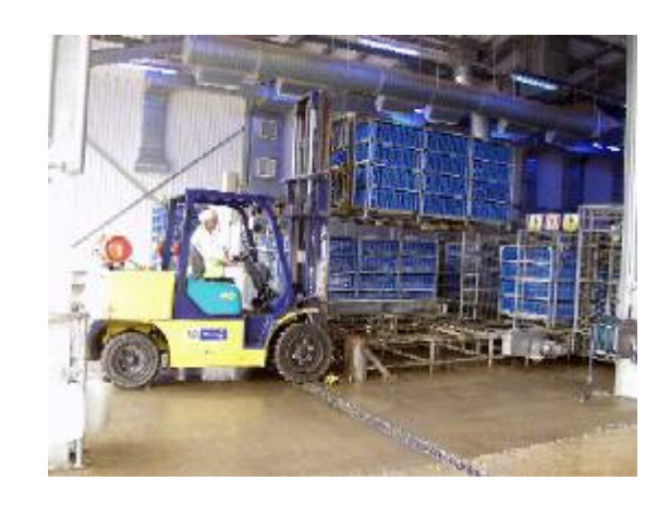
Diagram 4: Crates being moved onto a conveyor system