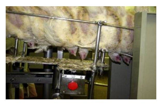
Diagram 9: Guide rail leading to the neck cutter

4.6 Birds should be hung on by both legs. The rigid shackle (see diagram 10) should be the correct size to accommodate the shank of the leg of the species of bird being processed. The fit of the shank of the leg in the tongue of the shackle must be secure enough to make sure that there is a good electrical contact when the bird enters the waterbath stunder. The fit must not be over-tight, as research has shown that this leads to birds experiencing unnecessary pain and excitement, which is prohibited under WASK.