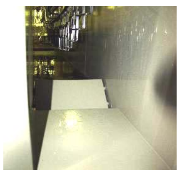
Diagram 11: A waterbath with entry ramp