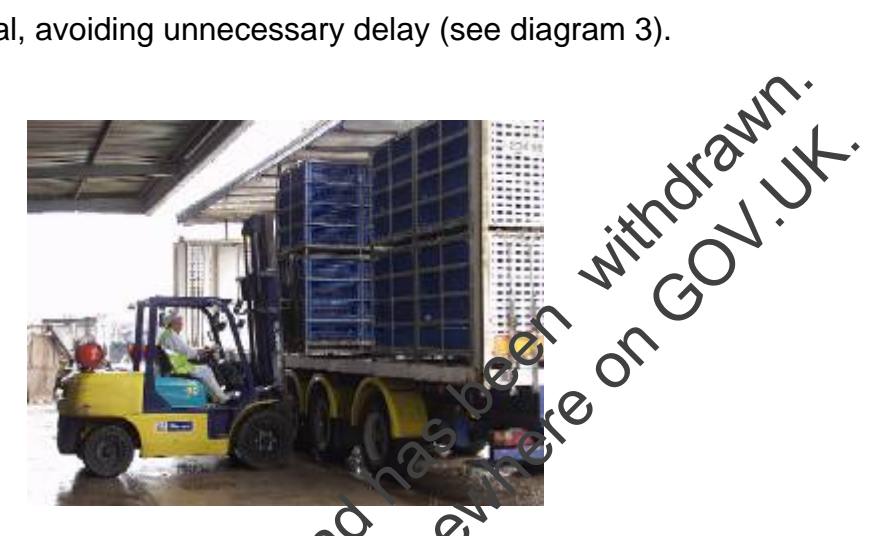
Diagram 3: Birds being unloaded into covered lairage

2.1 The law requires that unloading areas must be constructed so that birds are both protected from adverse weather conditions and are provided with adequate ventilation. Birds must be unloaded from vehicles as soon as possible after arrival, avoiding unnecessary delay (see diagram 3).