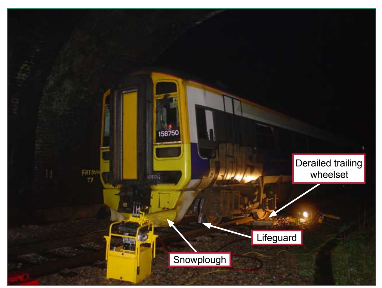
Figure 3: Leading end of Unit 158750 and derailed leading bogie

26 Unit number 158750, which formed train 2G93, comprised vehicles 52750 (leading) and 57750. Each vehicle had one powered bogie. The maximum operating speed of the train was 90 mph (145 km/h). Figure 3 shows the leading end of the train and derailed leading non-powered bogie.