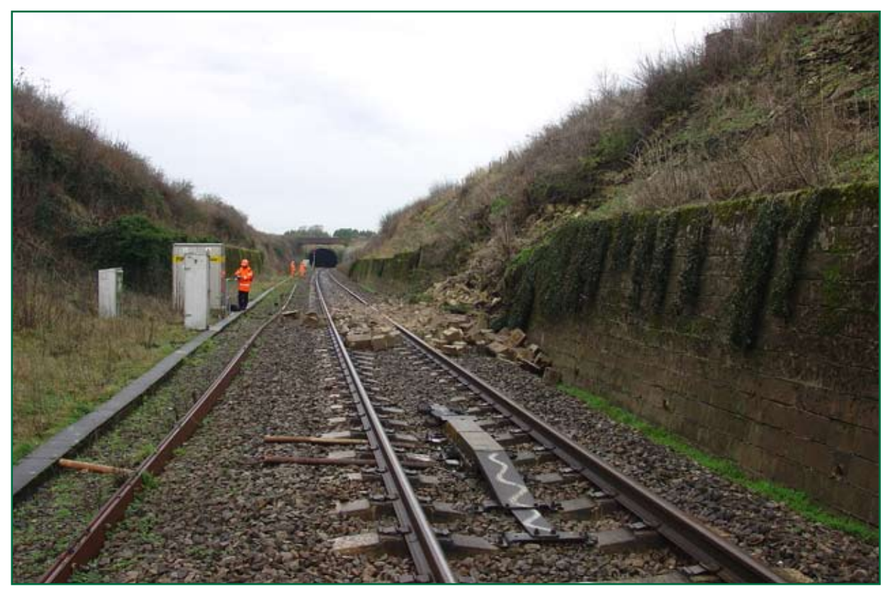
Figure 2: View of derailment site in the direction of travel

24 The permissible line speed from 82 miles 70 chains to the northern portal of the tunnel is 90 mph (145 km/h) for multiple unit trains and 100 mph (161 km/h) for High Speed Trains (HSTs).