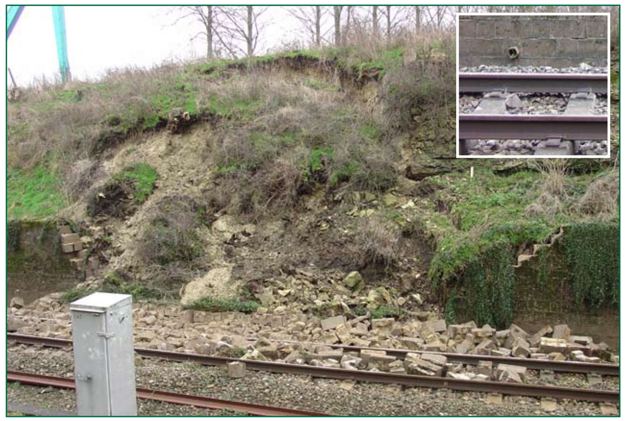
Figure 4: Derailment site showing cutting slips, state of backfill and typical weep hole (inset)

44 The cutting rises to a maximum height of approximately 9 m above track level and the crest is located 13 m from the cess rail. The geology of the cutting comprises soft limestone rock strata overlaid with a stiff clay. In places the clay has been weathered to a very soft, almost fluid, consistency. Towards the top of the slope, there was a primary slip (Figure 4) which had left a scar face approximately 10-14 m long and 1-1.5 m deep. Approximately half way down the slope, there was a secondary slip , approximately one third the size of the primary slip from which a soft clayey discharge, loose rocks and firmer clay layers had descended down the slope and run onto the back of the wall.