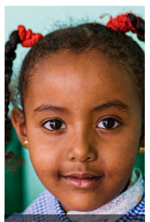
We will support work in education by helping 6.5million more girls go to school over the next 5 years

continue to support peace and security across the globe, including through the work of the Human Rights Council. We are working to improve access to security and justice services for 10 million women and girls. We will support efforts to improve governance and tackle corruption and bribery, through the work of the Open Government Partnership, the UN, and a Global Anti-Corruption Summit led by Prime Minister David Cameron in London.