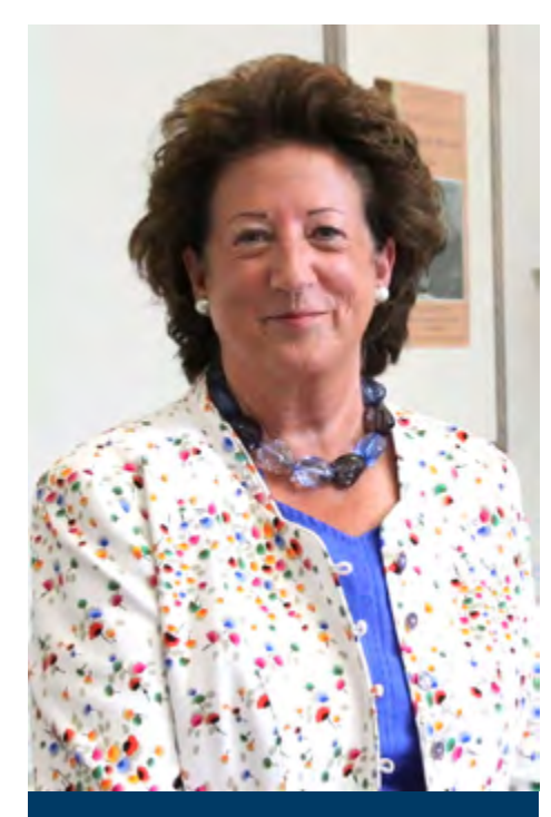
Foreword by Baroness Anelay, Minister for Human Rights