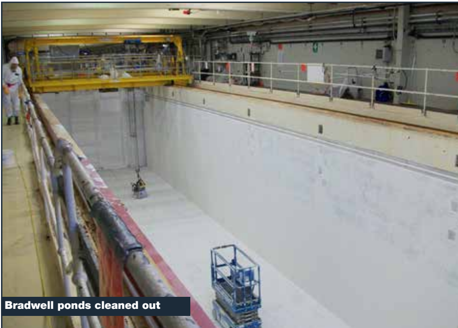
Bradwell ponds cleaned out