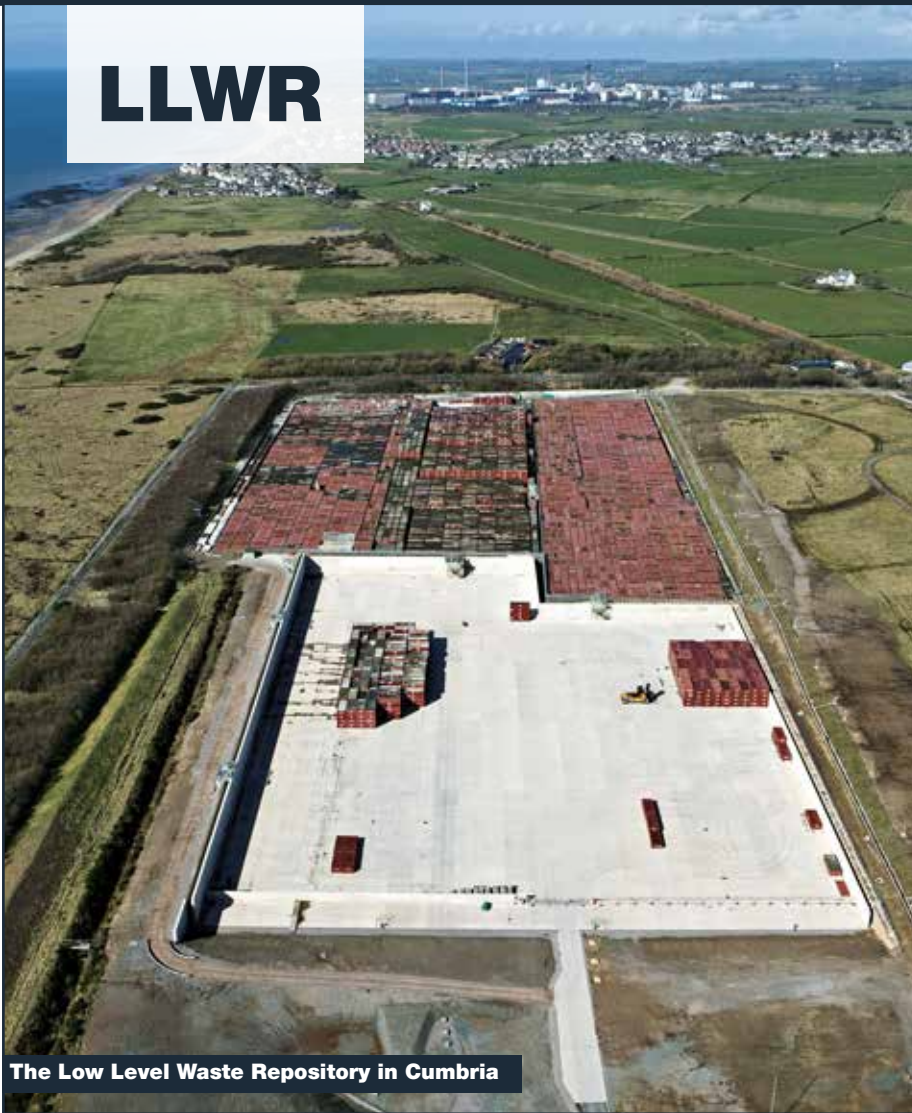
The Low Level Waste Repository in Cumbria