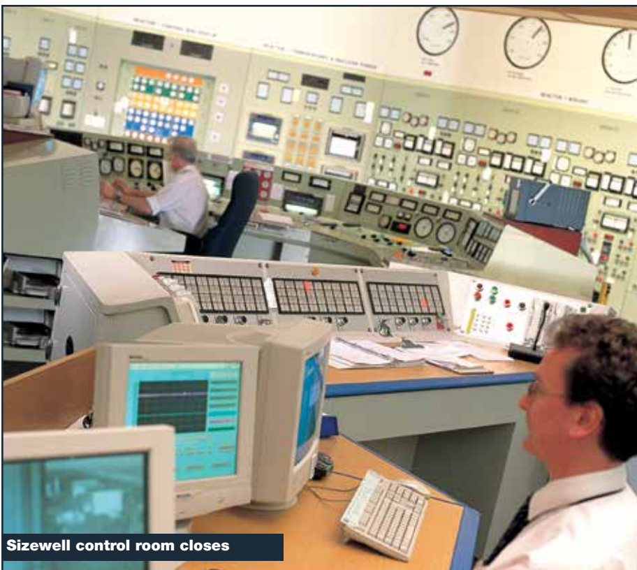
Sizewell control room closes