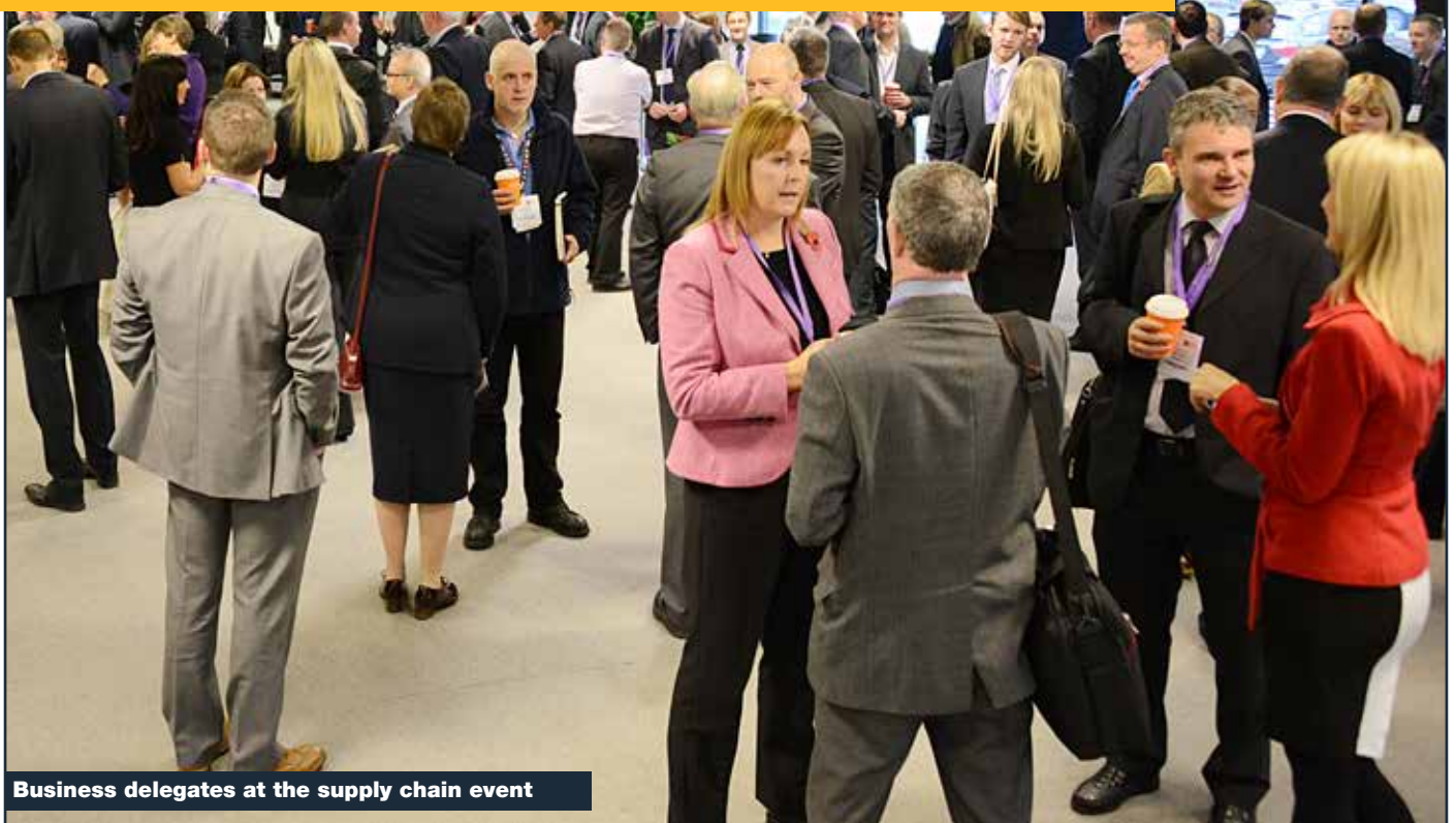
Business delegates at the supply chain event

Europe's largest event for the supply chain attracting more than 1,000 visitors