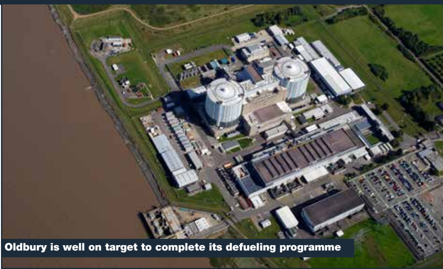
Oldbury is well on target to complete its defueling programme