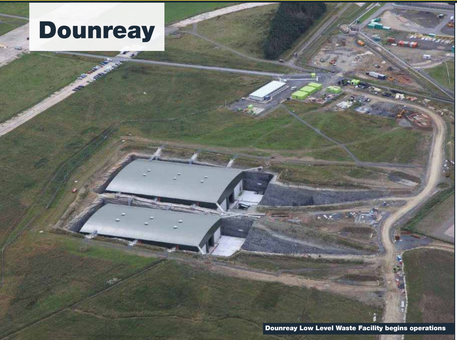
Dounreay Low Level Waste Facility begins operations

Dounreay was the UK's centre of fast reactor research from 1955 to 1994.