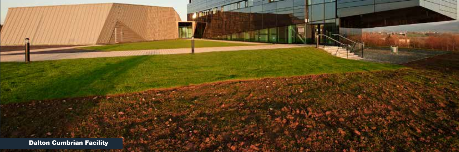
Dalton Cumbrian Facility

R&D investment totals around £90 million each year