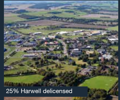
25% Harwell delicensed

In the pioneering days of the early nuclear industry, much of the research was done at two sites: Harwell and Winfrith.