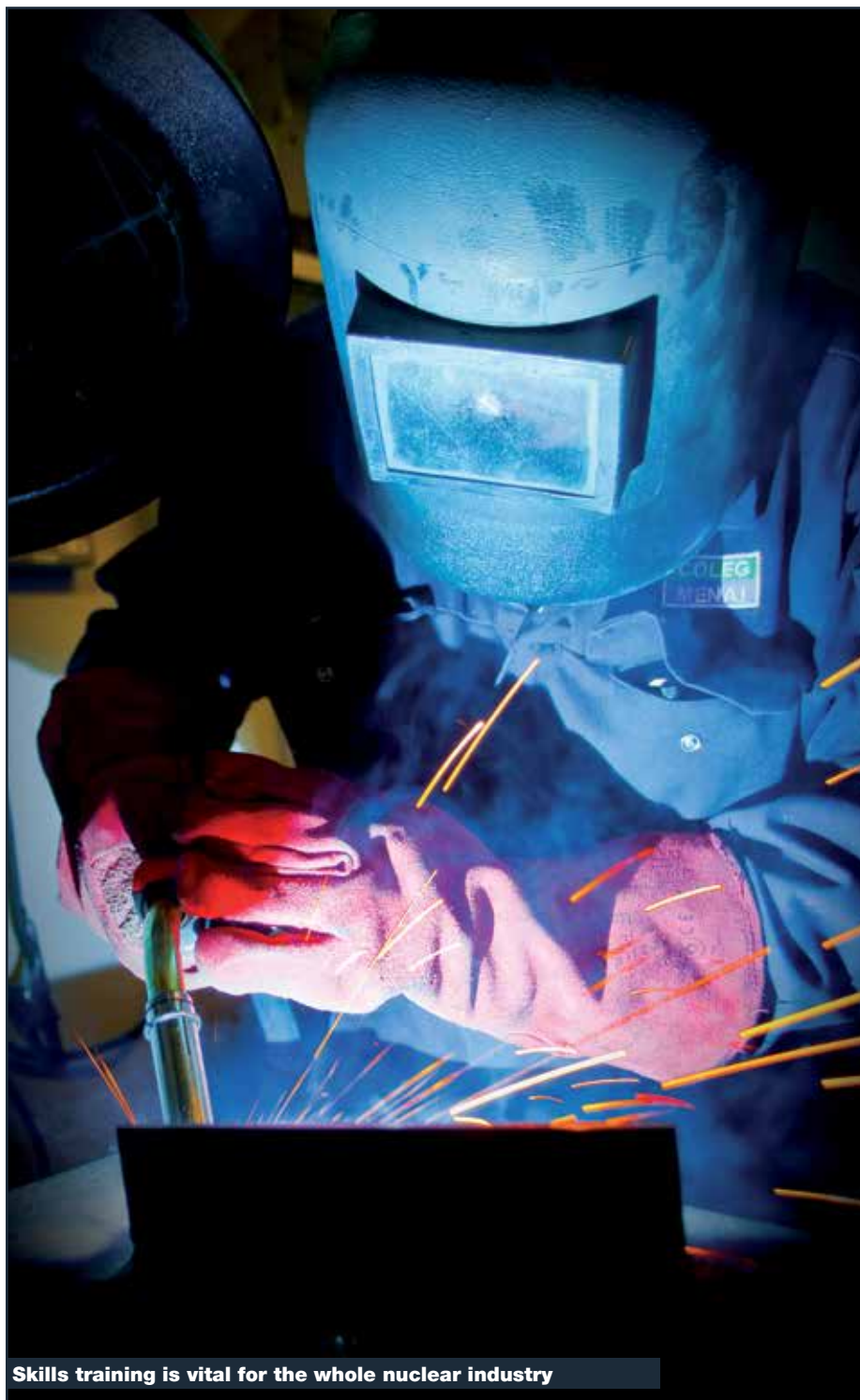
Skills training is vital for the whole nuclear industry

Other facilities supported by the NDA include Cumbria's nuclear training centre Energus, the Construction Skills Centre in Cumbria, the Engineering Skills Centre at North Highlands College in Scotland, the Energy Skills Centre at Bridgwater College in Somerset, the Energy Centre at Coleg Menai and the Coleg Meirion Dwyfor CaMDA Engineering Skills Centre in Dolgellau, Wales.