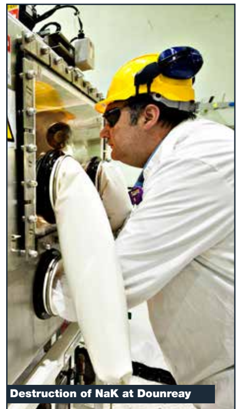
Destruction of NaK at Dounreay

In 2012, the site began to move more than 70 tonnes of historic nuclear material, including both unirradiated and irradiated material, to Sellafield which has facilities for treatment and storage. The material has been at Dounreay for many decades and the transfer requires a complex programme of repackaging in purpose-built high-tech facilities.