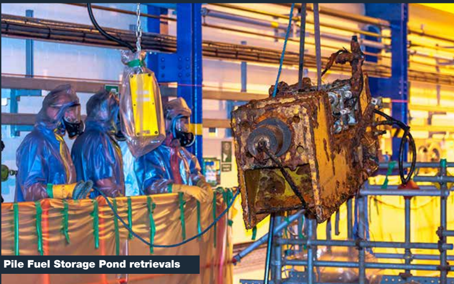
Pile Fuel Storage Pond retrievals