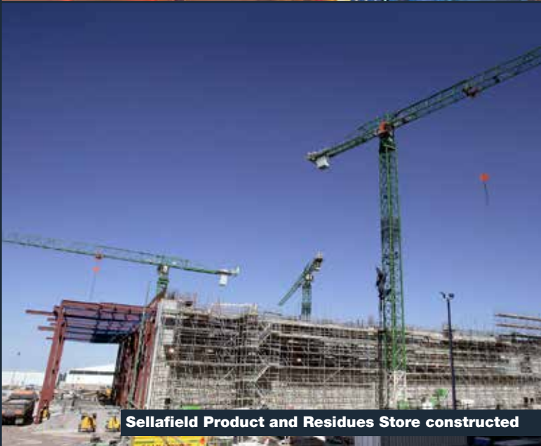
Sellafield Product and Residues Store constructed