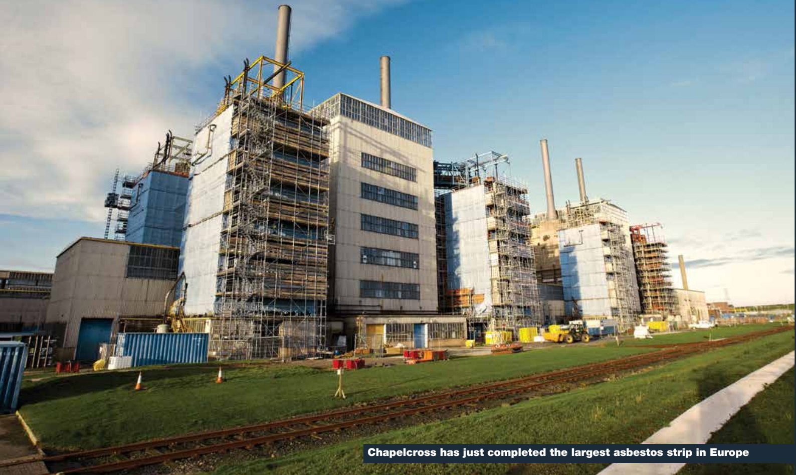
Chapelcross has just completed the largest asbestos strip in Europe

More than £1 billion of additional income from extended generation at Wylfa and Oldbury.