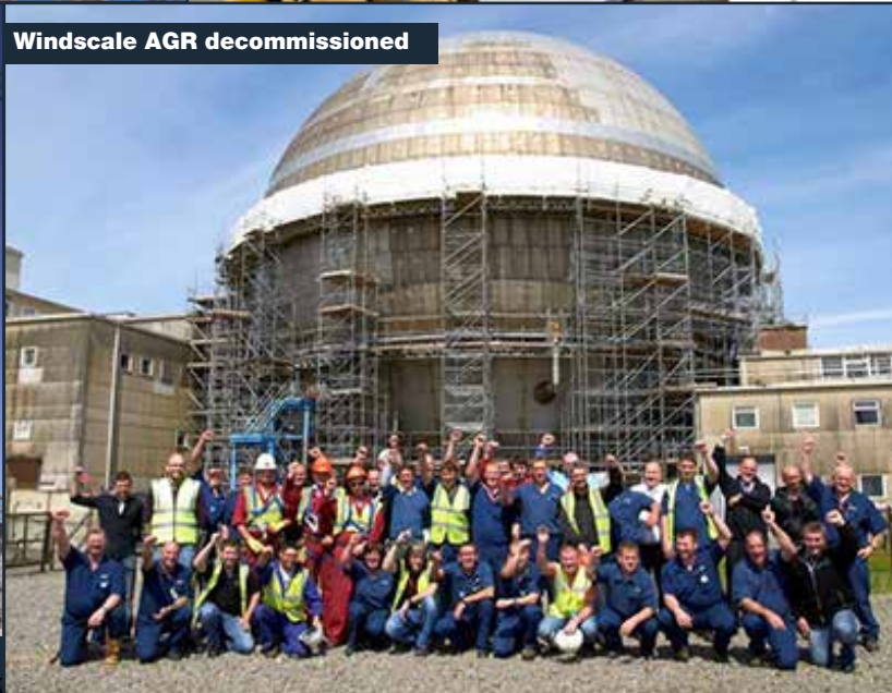
Windscale AGR decommissioned

In 2011, a major milestone was achieved with the completion of the WAGR decommissioning, making it the first-ever commercial-scale nuclear reactor to be fully decommissioned.