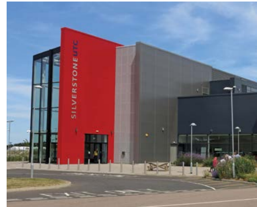
Silverstone race track, Northamptonshire

We're extremely aware of the issues that building a new railway presents to those who live nearby, and we take our responsibility to you very seriously. Ultimately, we want to make HS2 mean something positive to everyone, whether it stands for fairness and clarity, better training for current and future engineers, a catalyst for jobs and investment in your area, a world-class railway or simply a new and exciting way to travel.