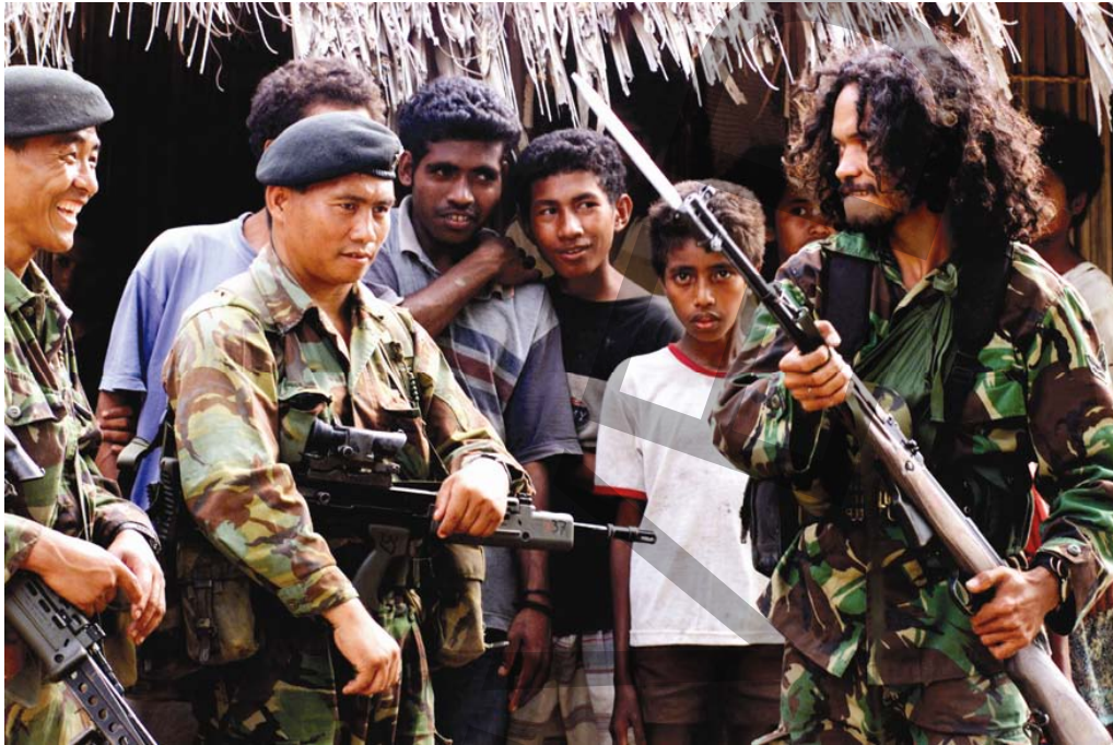
Application of Domestic Law and International Human Rights

25. UK Responses. The range of our responses in 2014 will be restricted by current commitments and their residual impact. Where we are committed to stabilisation as a national objective, this will demand a more effective integration of all instruments of power to deliver political resolution. During this period, UK Armed Forces will operate internationally in circumstances of political or societal breakdown, and this challenge will frequently result in the potential for escalating violence. From 2014 there will be a proliferation of smaller conflicts and events that may require a range of concurrent military responses, from prevention through containment to intervention. In order to provide Her Majesty's Government with options, there will be a requirement for increased situational understanding, and judgment from our people, as well as improved cross-government, multi-agency and international co-operation. Experience shows the likelihood of new challenges in this timescale; these will warrant urgent and non-discretionary UK military responses. These responses may include: conducting humanitarian relief operations; non-combatant evacuations; dealing with imminent terrorist attacks or threats to UK energy supplies; or focused coercive actions (such as raiding by special or specialised forces). At home, Military Assistance to