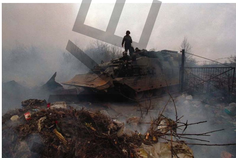
Clutter in Congested Environments

b. Cluttered. Clutter (which leads to an inability to distinguish individuals, items or events), particularly in congested environments, will provide the opportunity for concealment and will confound most Western sensors. Our adversaries (and at times ourselves) will seek to blend into the background, but locals, with their innate knowledge of their environment will hold an advantage. Increasing requirements for legitimacy will