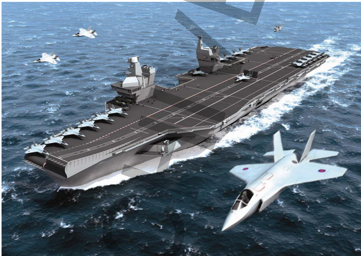
Deterrence is Primarily about Stopping High-End Threats

enough to influence the perceptions of potential adversaries regardless of their mindset. Deterrence is likely to remain effective against state actors and may also have a degree of utility against some non-state actors although it will remain impossible to deter all extremists in all circumstances. There is considerable risk that simply because deterrence does not stop all of today's threats – terrorists in particular – it may be viewed as having limited effectiveness. Deterrence is primarily about stopping high-end threats and, in their absence, it must be assumed to be effective. If it is removed the smart, adaptive adversary will simply raise his game to a higher level.