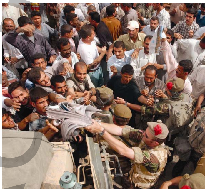
Centrality of Influence

develop and use increasingly sophisticated methods. This battle of the narratives, which is not just a matter of improved public affairs, will take place in a decentralised, networked and free-market of ideas, opinions and even raw data, which will weaken the immediacy and influence of mainstream news providers. Breaking events will be increasingly transmitted directly to individuals at ever higher tempo, often without government or editorial filters, or legal sanctions and safeguards. Although the 'propaganda of the deed' is well established and