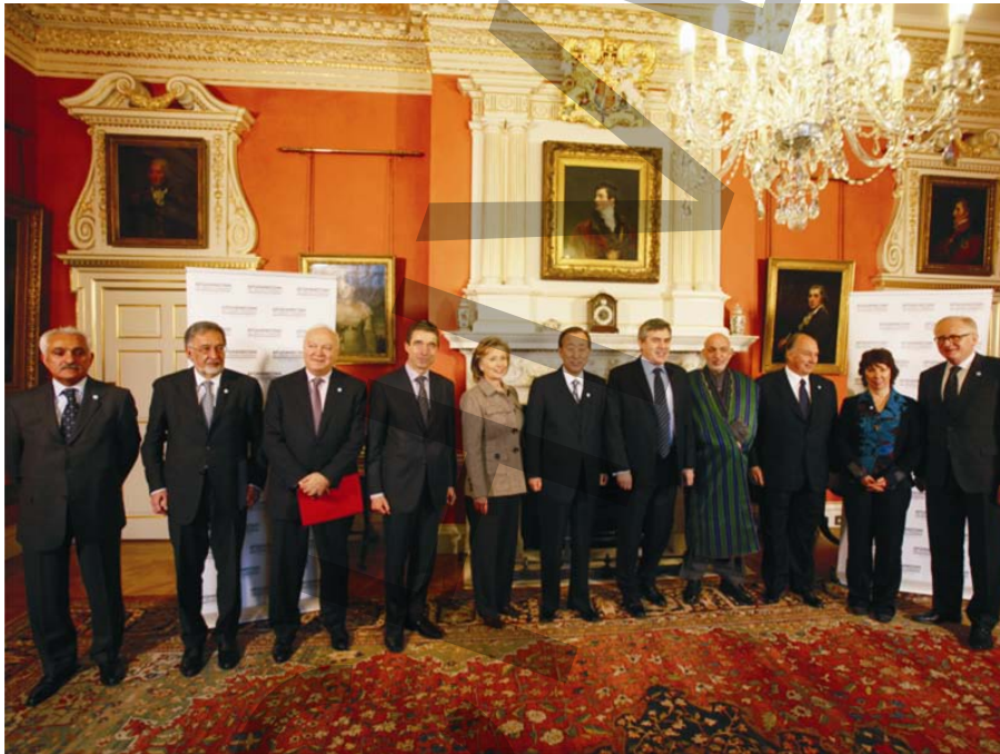
Partnerships as a Potential Strategic Edge

grow and the weight of reliance we put on partnership as a core concept should impact the choices we now make. For example, the UK could concentrate its resources on certain areas and rely on partners to provide the full spectrum of capabilities. This approach would affect the dynamic of our relationship with our partners, and particularly the US. More clearly identifying what our partners (especially the US) require of us and what we are willing to offer in return, will better allow us to focus on the practicalities of interoperability. We need to recognise better the dynamics and limitations of partnership, in the same way that we now seek to understand how deterrence operates.