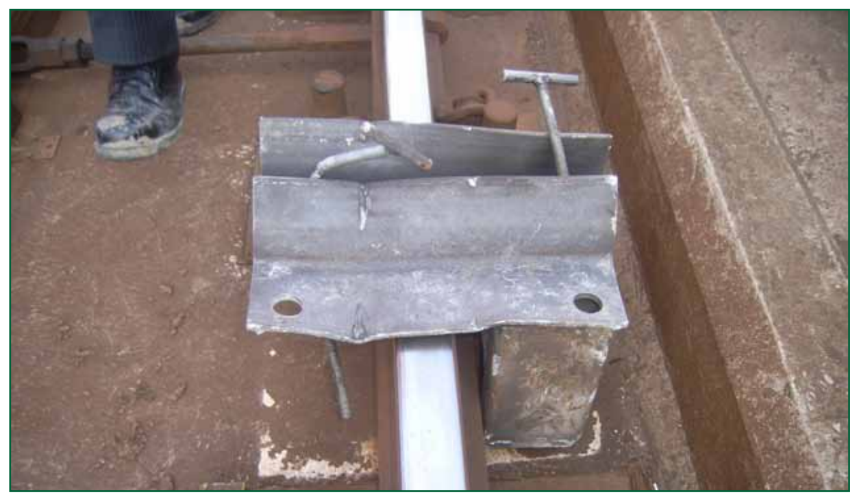
Figure 4: Drilling jig (damaged as a result of the derailment) shown in its operating position with two drilling guide holes showing on the front edge

64 The drilling jig is a fabricated steel tool which provides location and guidance for drilling one or more holes in precise relationship to a fixed point. A detailed description of why the jig was being used is given in paragraphs 68 to 78.