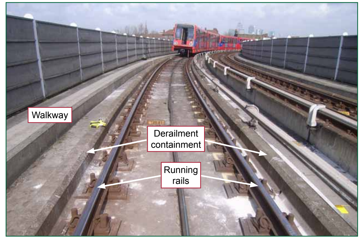
Figure 3: The Lewisham extension showing running rails and concrete derailment containment