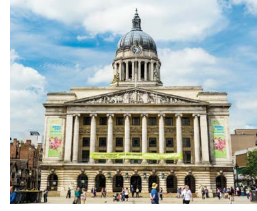
Nottingham Council House, Old Market Square

We're extremely aware of the issues that building a new railway presents to those who live nearby, and we take our responsibility to you very seriously. Ultimately, we want to make HS2 mean something positive to everyone, whether it stands for fairness and clarity, better training for current and future engineers, a catalyst for jobs and investment in your area, a world-class railway or simply a new and exciting way to travel.