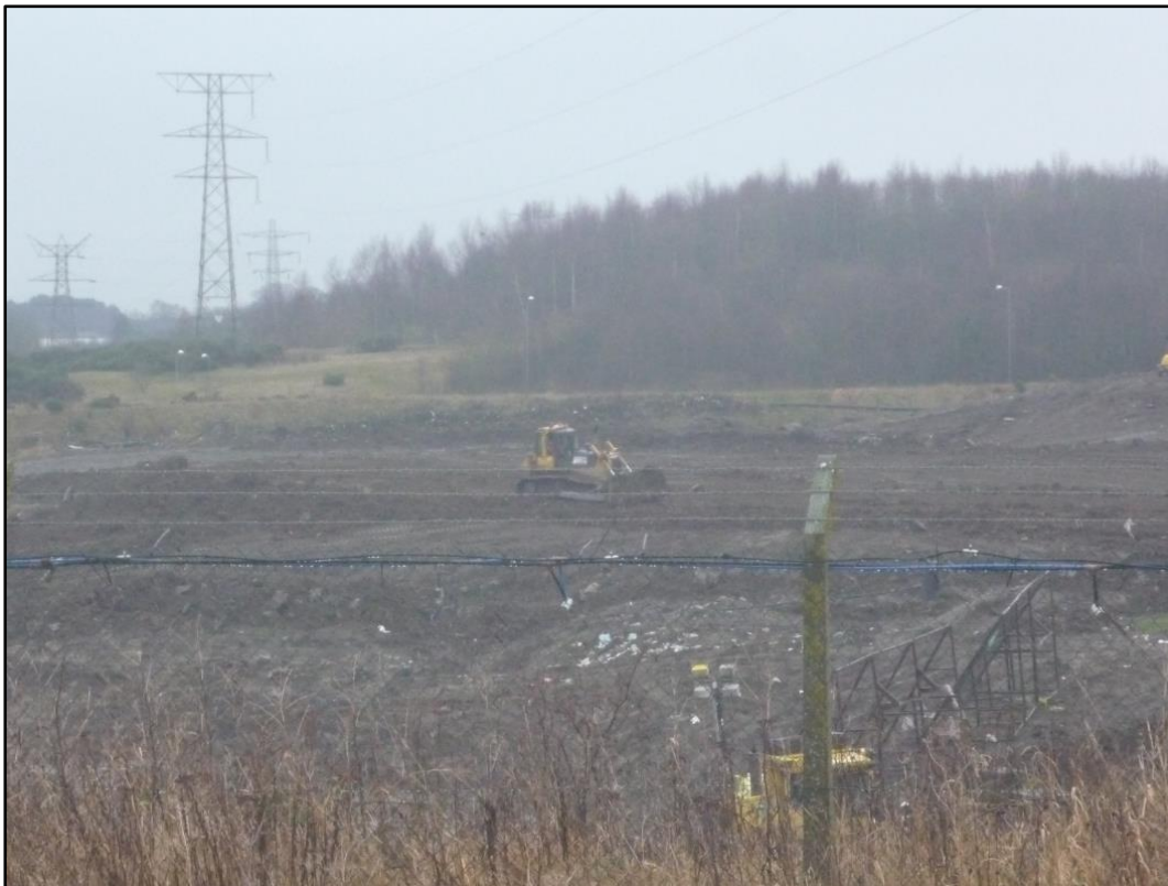
Soil being placed on the site, following closure