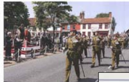
Last year's President of the Town Parade by 10th Assault Regiment