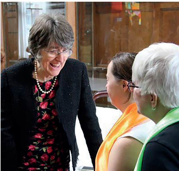
Meeting members of the Include Choir

Discussion in Kent and Medway with those working with offenders with learning disabilities provided further insights in to the difficulties encountered in supporting those with capacity impairments who have tendency to impulsive and irrational behaviours, and into novel ways to provide support. This meeting revealed the paucity of objective evidence and the need for scientific scrutiny of data to reveal the most effective types of support for people in this group.