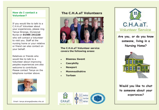
CHAA T volunteer service leaflet