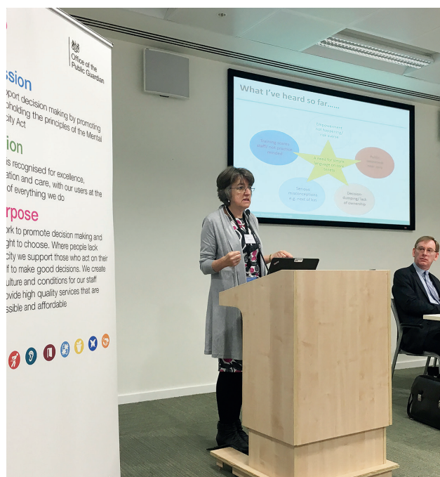
Baroness speaking at the Office of the Public Guardian event

Ministerial meetings include meeting with Ministers at the Ministry of Justice, the Department of Health, and the Minister for Health and Social Services in Wales.