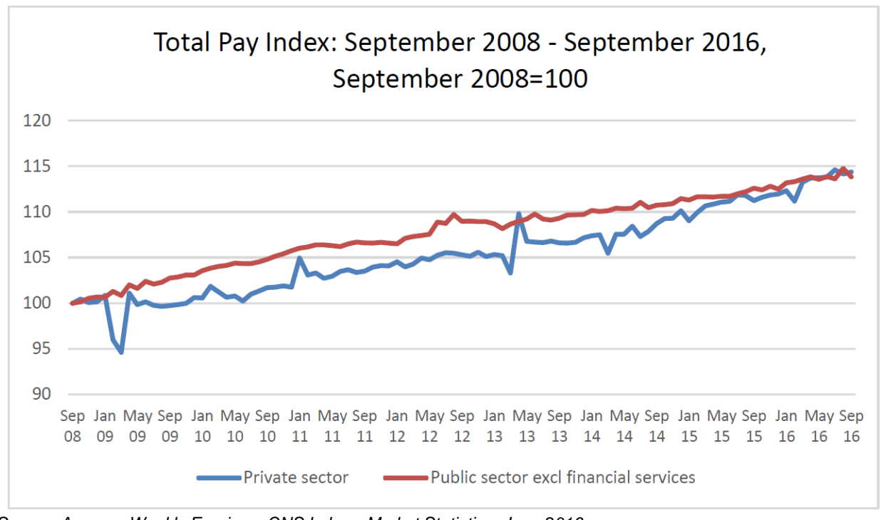
Figure 2: Total pay comparison