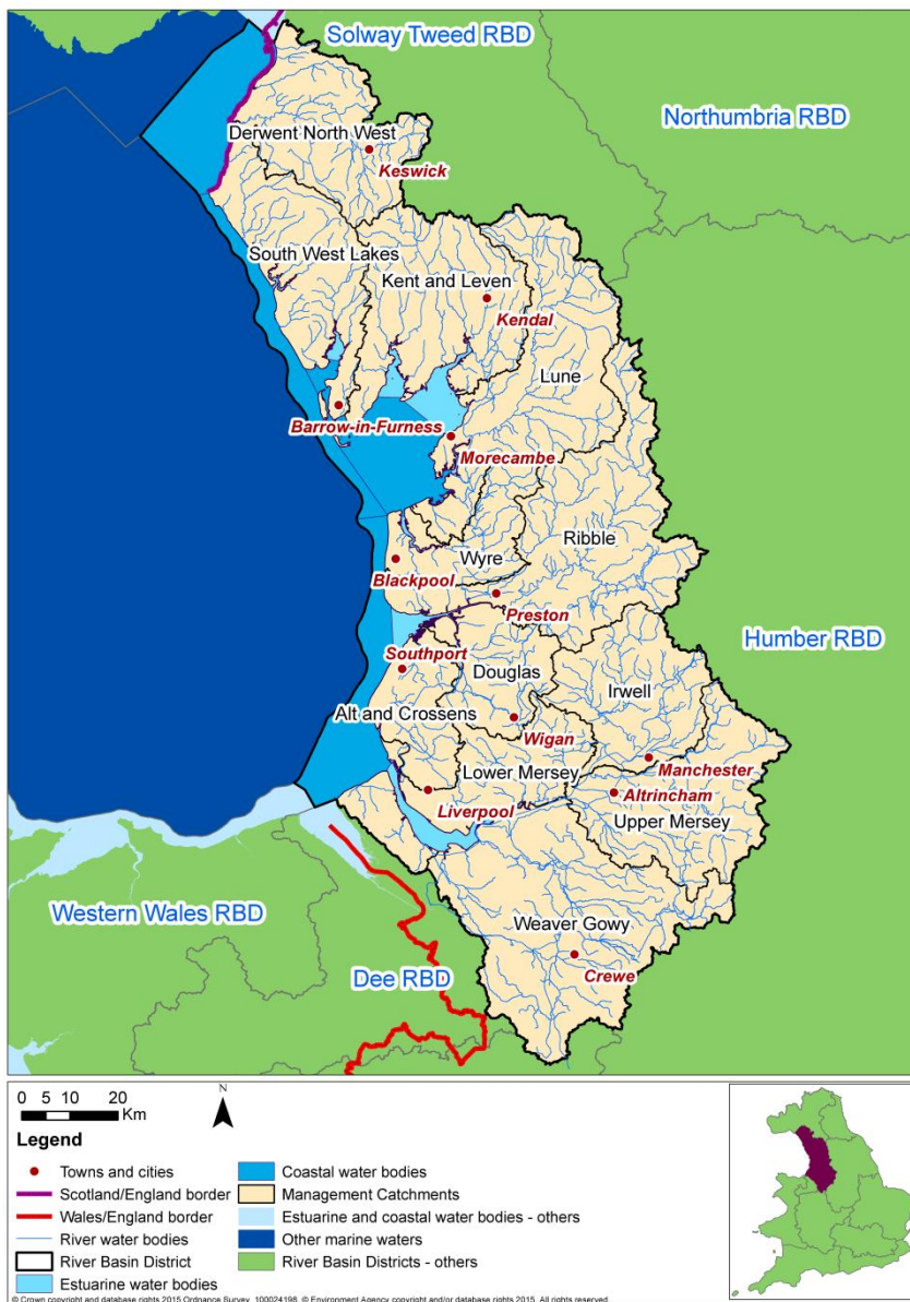
Figure 1 Map of the North West river basin district and management catchments

Further details of the measures proposed to address the Significant Water Management Issues for the North West RBD are described in section 4.1.