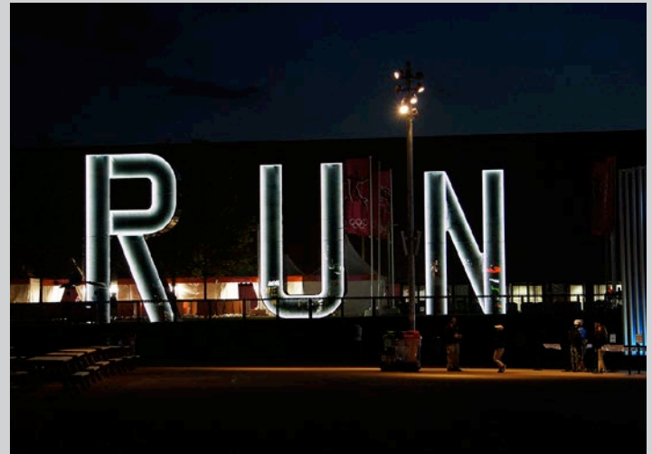
RUN by Monica Bonvicini 2011, Queen Elizabeth Olympic Park

The panel suggested three areas where there is great potential for art: stations and their approaches; civil engineering structures; and the experience of the traveller. Each of these will require its own approach.