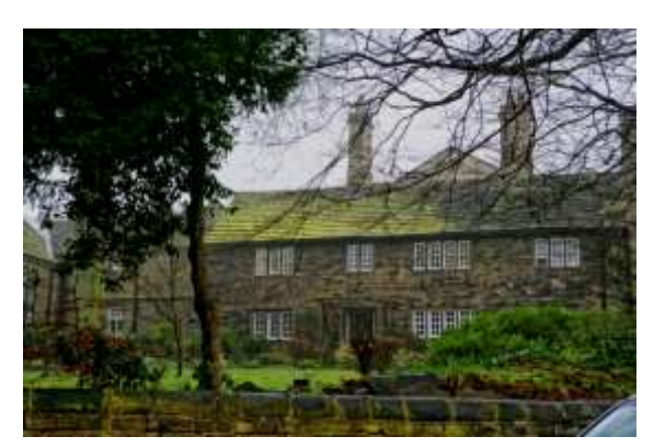
King James's School, established by Royal Charter, 1608

King James's School is an average-sized school serving an area on the eastern outskirts of