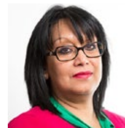
Baroness Verma Parliamentary Under Secretary of State for International Development and Ministerial Champion for Tackling Violence against Women and Girls Overseas

Department for International Development