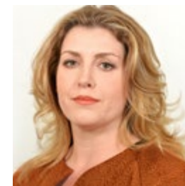
Penny Mordaunt Minister of State for the Armed Forces