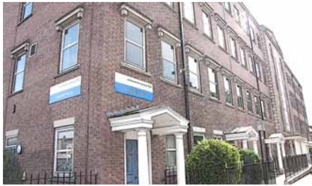
Northamptonshire Healthcare NHS NHS Foundation Trust