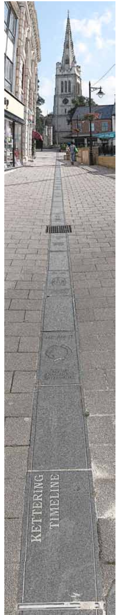
THE TIMELINE - KETTERING

The pictures of street scenes in this annual report have been used to give a pictorial representation of Northamptonshire and are not directly connected with the work of the MAPPA.