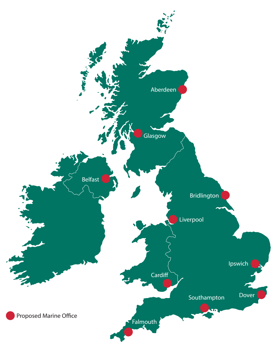
Figure 1: Proposed Locations for Marine Offices