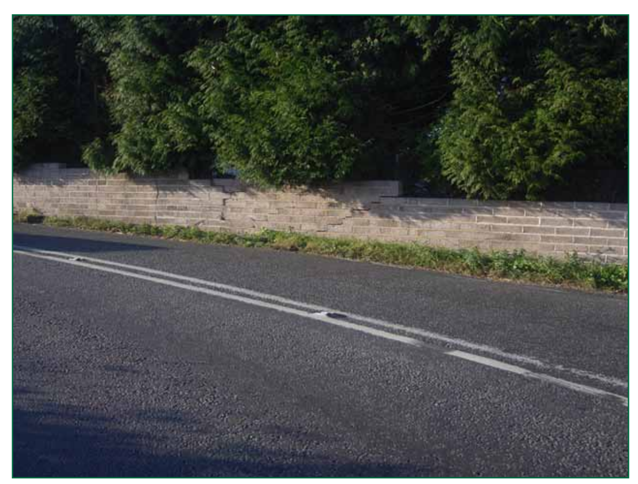
Figure 2: Concrete block wall showing impact damage

4. The bridge is situated on a double bend, which requires drivers to slow down as they approach. The car involved in the accident was travelling south and did not negotiate the left-hand bend approaching the bridge. It crossed the carriageway before colliding with a substantial garden wall constructed of concrete blocks (figure 2) on the opposite side of the road. The force of this impact did not topple the wall, but instead caused the car to rebound diagonally back across the road. This trajectory projected the car to the left of the bridge parapet and onto the railway (figure 3). There were no other vehicles involved.