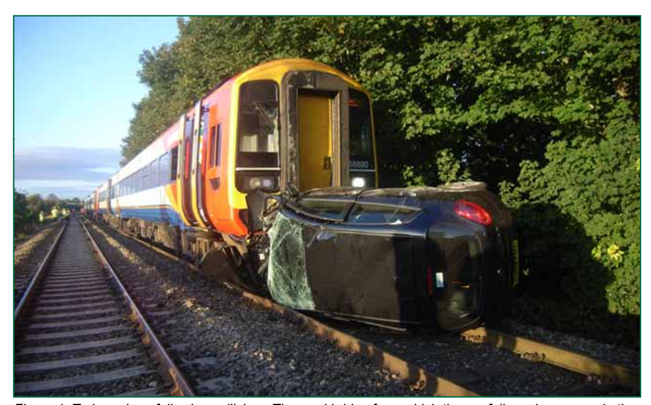
Figure 1: Train and car following collision. The road bridge from which the car fell can been seen in the distance