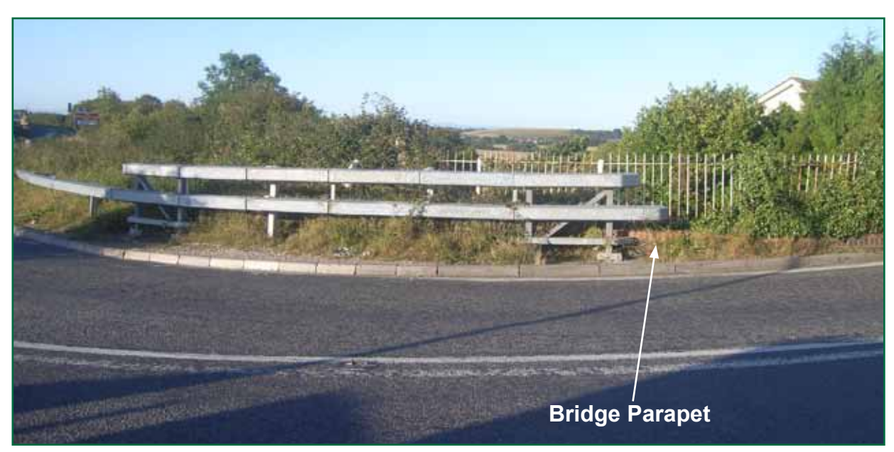
Figure 5: Steel crash barrier installed at the south-east corner of the bridge

6. Collision records for this site for the ten year period to September 2009 show that there have been 15 incidents involving northbound vehicles during this period that resulted in personal injury¹. The most serious of these occurred in November 2003 when a car crashed through the north-east parapet and landed between the tracks (figure 6). On that occasion, trains were stopped before a collision occurred. During the same ten year period, only one accident is recorded involving a southbound vehicle, which collided with the garden wall in a similar manner to the most recent accident, but without rebounding onto the railway.