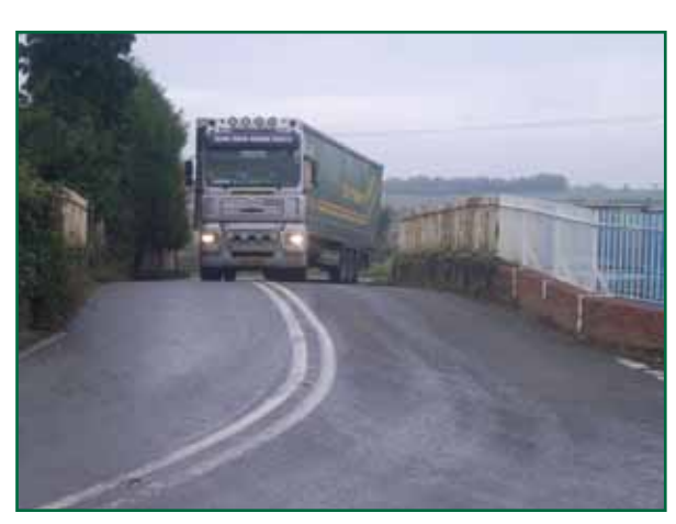
Figure 7: Southbound vehicle straddling centre white lines due to sharply curved road alignment

7. The relatively high frequency of accidents at this site indicates that other risk factors are present. The reverse curve and narrow carriageway combine to limit visibility for oncoming traffic, while requiring large vehicles to straddle the double white line in the centre of the road. This creates a collision risk with vehicles approaching in the opposite direction (figure 7), the risk to the railway being compounded by the substandard level of containment offered by the low brick parapets. Furthermore, there are road junctions on both approach bends (figure 3).