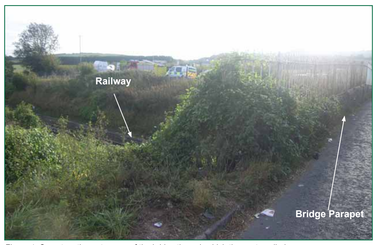
Figure 4: Gap at north-west corner of the bridge through which the car travelled

5. The west approach to the bridge is not provided with highway crash barriers extending from the end of the bridge parapets (figure 4), and the adjacent railway boundary fence was incapable of preventing the car from passing through. The east approach is immediately adjacent to a bend, and is provided with crash barriers on both sides of the carriageway as a consequence (figures 3 and 5).