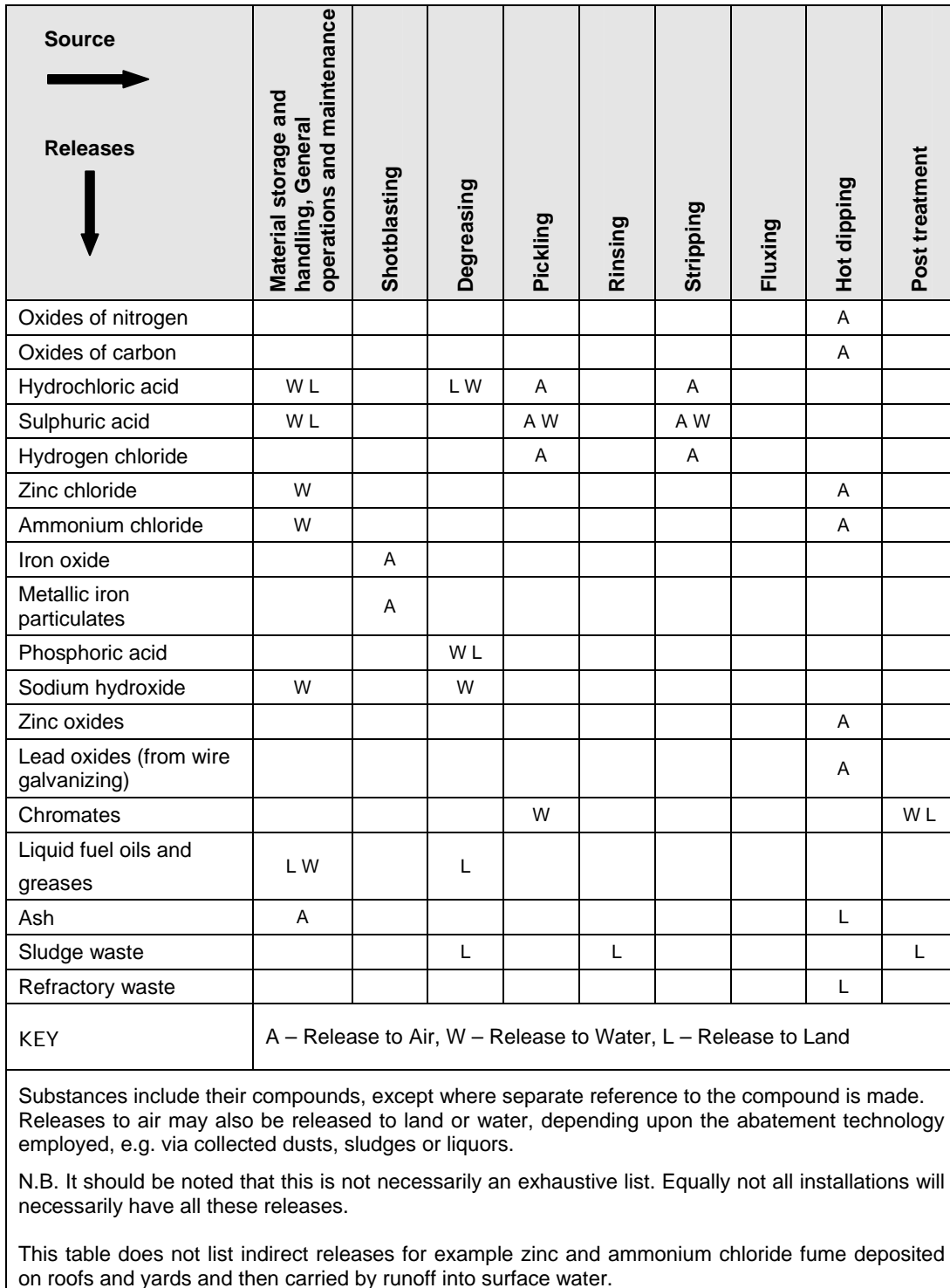
Table 2: Summary of direct releases