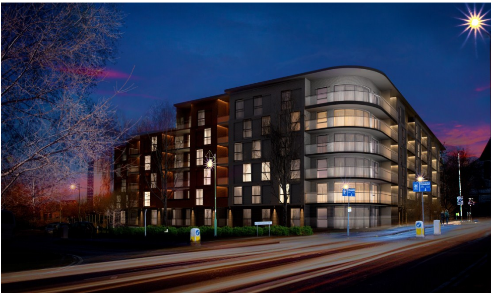
Figure 2: Birmingham City Council's Embankment scheme in Westside

Embankment is a 92 unit apartment scheme, with a number of design features which set it apart from speculative apartment developments. The apartments are spacious, and set within landscaped grounds, with onsite parking and cycle stores. The external space is as important as the apartments with a welcoming reception lobby. Embankment aims to set a new standard for private rented sector housing in the city, and to incentivise other private rented sector providers to follow in its example.