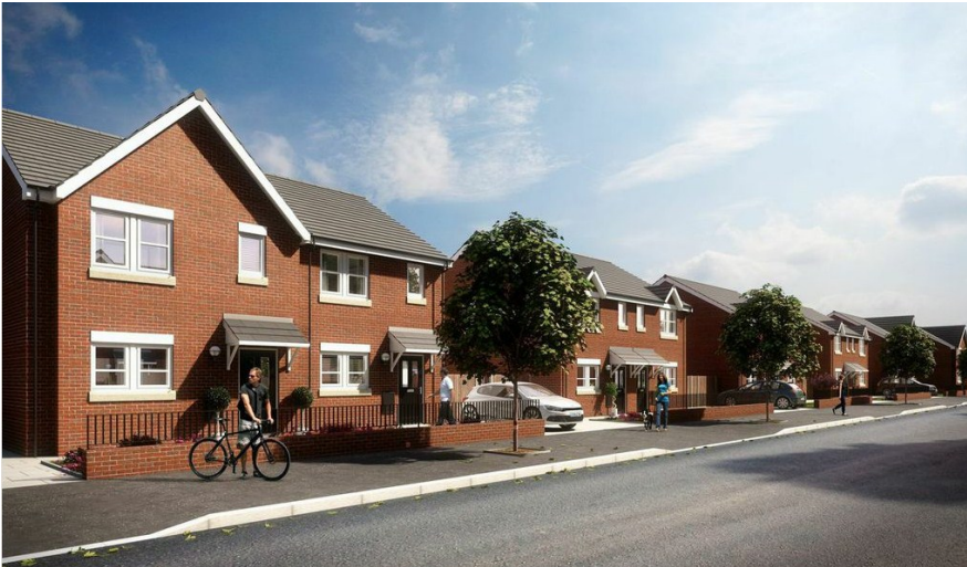
Figure 3: Matrix Homes development, Manchester