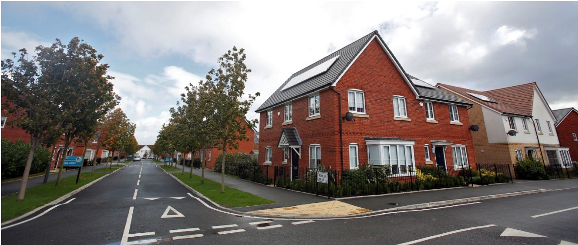
Figure 6: Sigma's PRS development at Norris Green, Liverpool.

Invesco Real Estate announced in November 2014 that it is raising up to £400m of equity for a private rented sector fund and in May 2014 it completed its UK debut with a £33m purchase of 118 Private Rented Sector home Vinyl Factory scheme in Hayes which it bought from be:here – Willmott Dixon's Private Rented Sector arm.