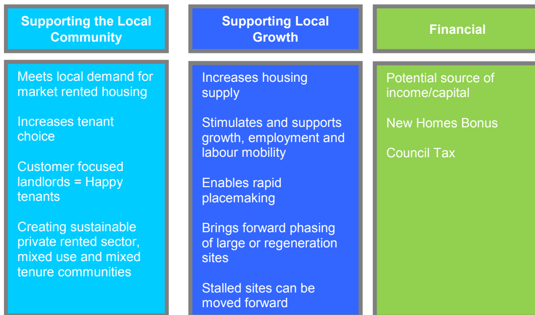
Figure 7 – Benefits to Local Authorities of Build to Rent

Build to Rent housing can provide a range of positive benefits to local authorities and the communities which they serve. This is summarised in figure 7 which we consider in more detail below.