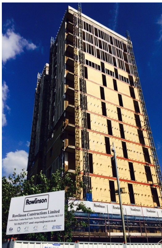
Figure 3: Three Towers scheme, Manchester

As at February 2015, £231m of Build to Rent fund deals have been completed which will provide over 3,000 new homes for rent with some significant deals in the pipeline. Examples of completed funding transactions include CS Capital Partners' 192 home Three Towers scheme in Manchester (see Figure 3) and Bovis-Mill Group's schemes within the South East, including Hemel Hempstead and Cambridge which will provide 190 private rented sector homes (see Figure 4).