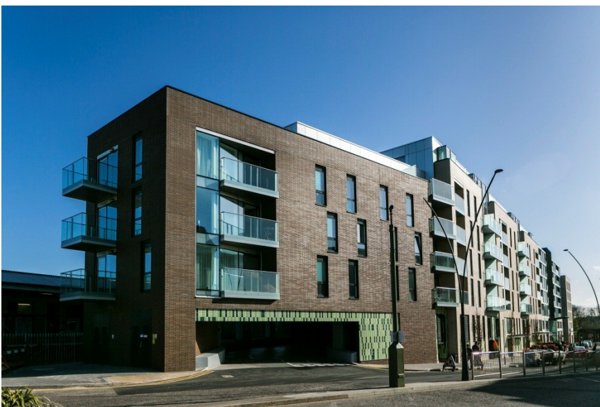
Figure 5: Fizzy Living development in Epsom

Another example is M&G Real Estate's 152 flat Victoria Square scheme in North Acton which is being developed by Hub Residential.