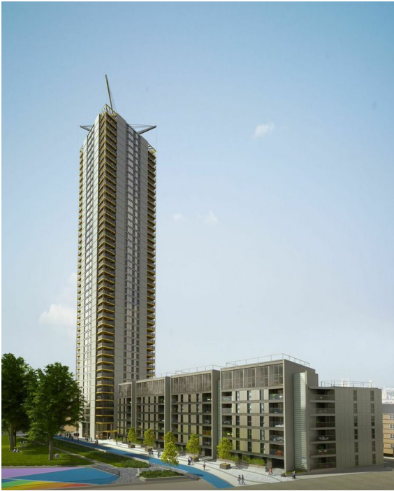
Figure 4: Newington Butts development in Elephant and Castle