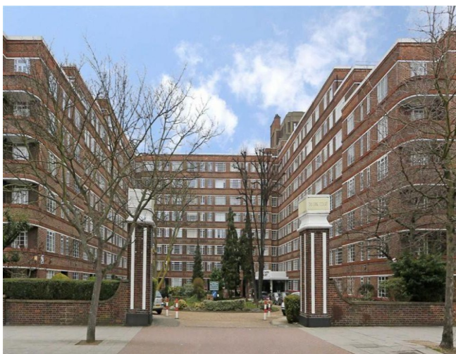
Figure 2 – Du Cane Court Balham

Institutional investors made a rapid exit from the sector in the 1960s when stringent rent controls and security of tenure were introduced by the Rent Acts. In 2011, only 1% of UK private rented sector housing stock was owned by institutions ( Source IPD, LSE Sept 2011 ). This is significantly lower than in other countries such as the USA and Germany, where private rented sector institutional ownership is around 13% and 17% respectively.