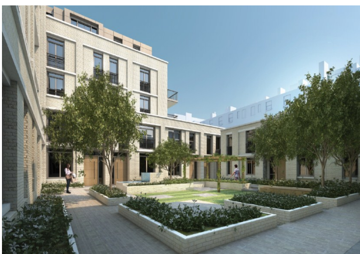
Figure 1: 19 - 27 Young Street development

The scheme is a high-quality brick building with stone detailing complimenting the unique character of the conservation area. Due to the adjoining conservation areas and the historic listed nature of most of the surrounding buildings, the team undertook significant consultation with the local authority and local residents to ensure that the impact of the scheme would further enhance the characterful area. The scheme won the 'Private Rented Sector' Housing Design Award in 2014.