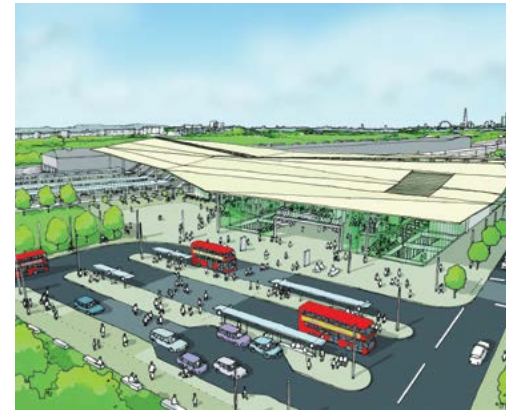
A visualisation of the new station at Old Oak Common

We're extremely aware of the issues that building a new railway presents to those who live nearby, and we take our responsibility to you very seriously. Ultimately, we want to make HS2 mean something positive to everyone, whether it stands for fairness and clarity, better training for current and future engineers, a catalyst for jobs and investment in your area, a world-class railway or simply a new and exciting way to travel.