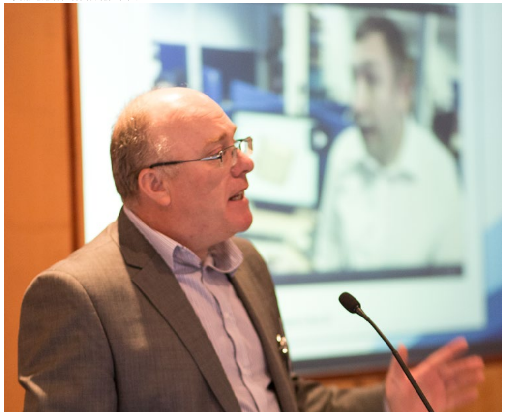
IPO staff at a business outreach event