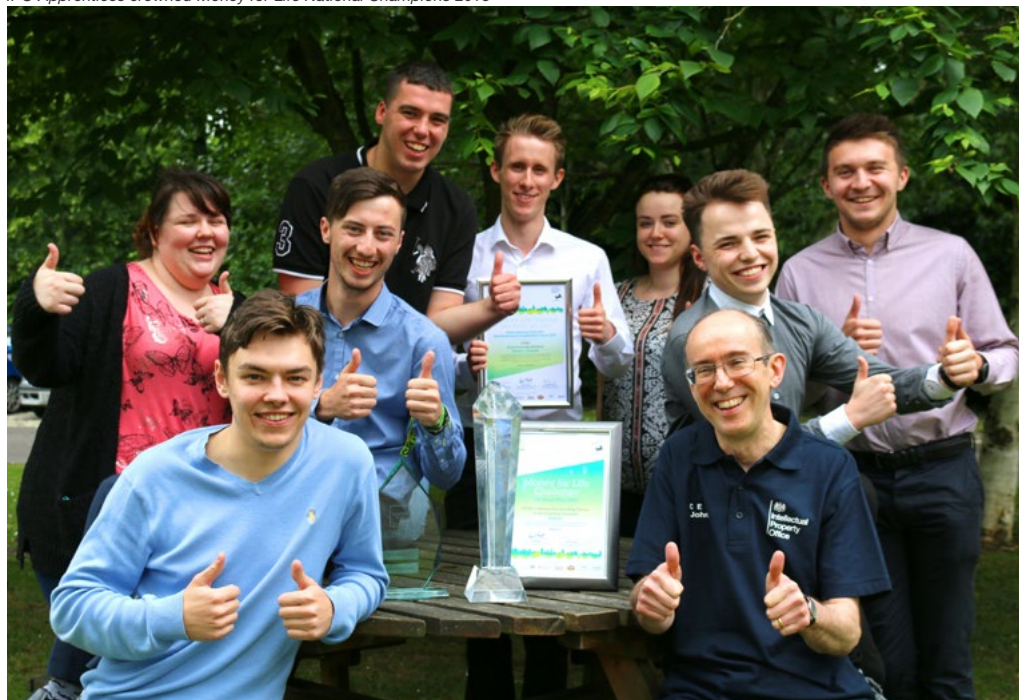
IPO Apprentices crowned Money for Life National Champions 2015