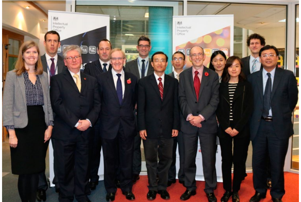
The IPO welcomes a delegation from the Chinese State Intellectual Property Office'

may also need advice about exports or development funding, for example. We want to be able to help them identify and access these services in as seamless a way as possible. This means really understanding their journeys, not just through the IP part of their business development, but more widely.