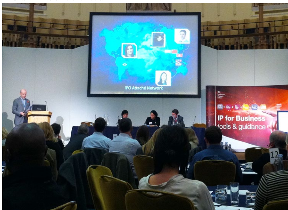
IP Attachés at an IP Business Advisor Conference in London