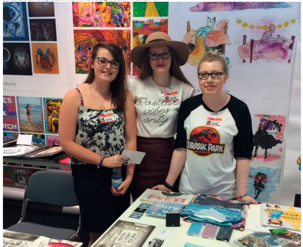
Sunderland University Students at the New Designers show in London