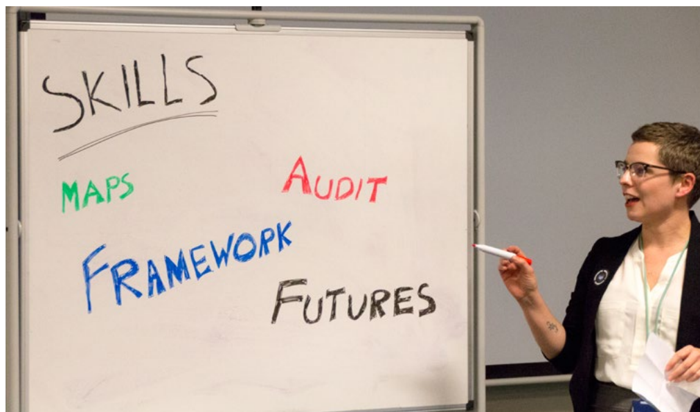
IPO staff workshops