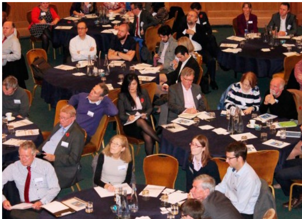
International IP Enforcement Summit, June 2014 in London, jointly hosted between the IPO, OHIM and EU Commission