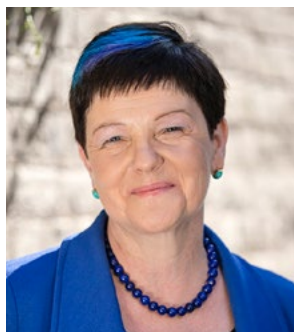
Baroness Neville-Rolfe, DBE, CMG Minister for Intellectual Property