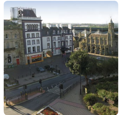
■ Court Square, Carlisle

Running every hour, HS2 services will bring the region to within two hours of Birmingham, and around two and a half hours of London.