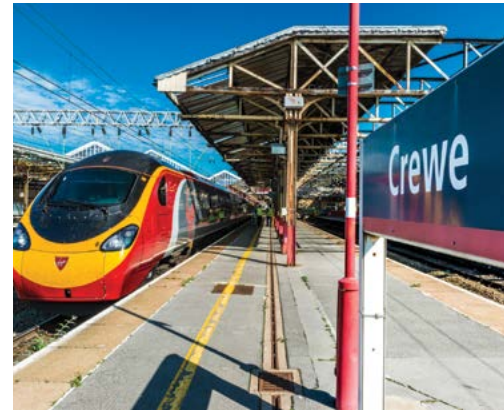
Crewe rail station

We're extremely aware of the issues that building a new railway presents to those who live nearby, and we take our responsibility to you very seriously. Ultimately, we want to make HS2 mean something positive to everyone, whether it stands for fairness and clarity, better training for current and future engineers, a catalyst for jobs and investment in your area, a world-class railway or simply a new and exciting way to travel.