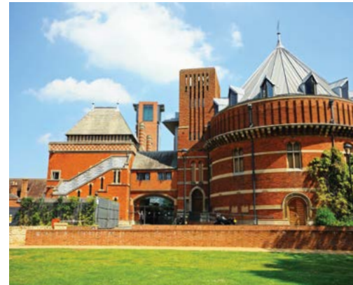
The Royal Shakespeare Theatre, Stratford-upon-Avon, Warwickshire

We're extremely aware of the issues that building a new railway presents to those who live nearby, and we take our responsibility to you very seriously. Ultimately, we want to make HS2 mean something positive to everyone, whether it stands for fairness and clarity, better training for current and future engineers, a catalyst for jobs and investment in your area, a world-class railway or simply a new and exciting way to travel.