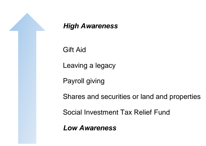
Figure 3.2: Awareness of tax reliefs

Whilst participants were generally aware that legacy giving existed, they did not believe it to be particularly relevant to them at this stage in their lives; it was seen as a form of relief to consider for the future. There was some awareness of payroll giving and some had used it in the past and said it was convenient. Shares and securities or land and properties as a form of relief were not generally thought to be as straightforward as Gift Aid. As with leaving a legacy, some did see this as an option for the future but not necessarily as one for now. Most participants had not heard of the Social Investment Tax Relief Fund, probably due to it newness.