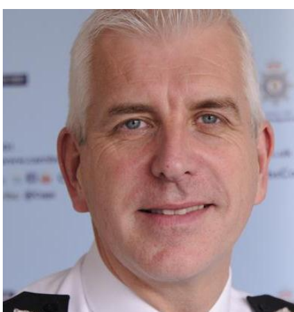
Alec Wood Chief Constable Cambridgeshire Constabulary