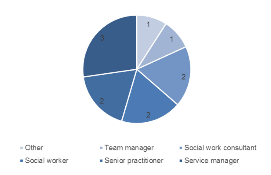
Figure 1: Learning sets attendees by role