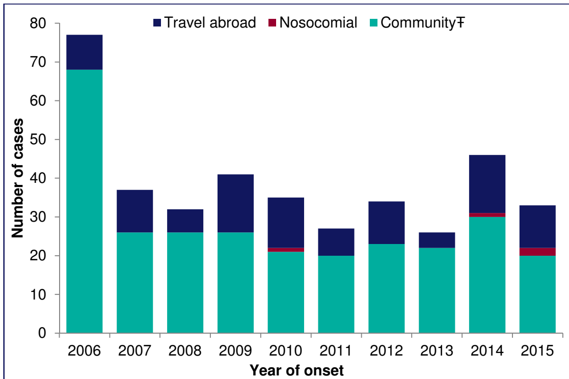
Figure 2: Number of confirmed Legionnaires' disease cases o in residents of East Midlands by year of onset and category 2006 to 2015