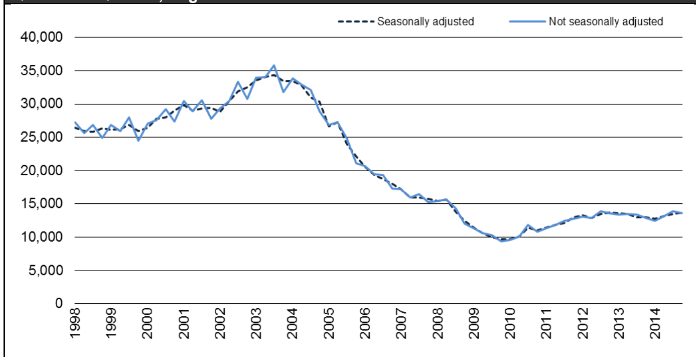
Chart 1: Households accepted by local authorities as owed a main duty each quarter, Q1 1998 to Q4 2014, England

See Live Table 770: Decisions taken by local authorities under the 1996 Housing Act on applications from eligible households, England.