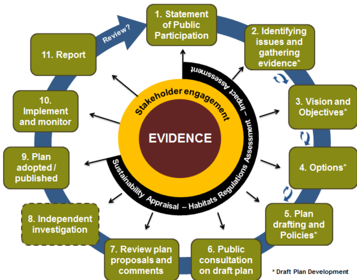
Figure 1: Stages and indicative process for producing marine plans in the north west marine plan areas. Stages 2 through 5 will progress through three “iterations”. The circular arrows between these stages represent feedback ‘loops’. Each iteration will end with an output on an annual basis that will be shared with stakeholders. The dotted line around stage 8 indicates that an Independent Investigation may not be required. We will maintain engagement with stakeholders throughout this approval period. Whether or not a plan is reviewed is dependent on the outputs of the report.

Marine planning for the north west will begin in spring 2016. Throughout the process, we will carry out ongoing engagement as the plan develops and will work closely with stakeholders and those interested in the north west marine plan areas. There are certain stages in developing the plan during which we are legally required to engage in a more structured and formal way, for example formal representations on the consultation draft plans. However, we think it is important to engage during other stages to ensure interested parties' views and knowledge are understood and inform the developing plan. The developing plan will also spend a proportion of time in government approval. Engagement will be staggered through three iterations which aim to provide government with earlier sight of the marine plan.