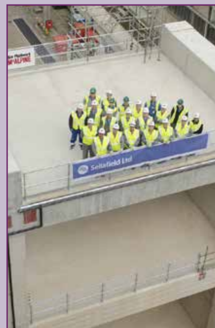
Photograph: Above, staff celebrate the completion of work

Sir Robert MacAlpine safely carried out both phases with almost 85,000 manhours of physical site work carried out without a single lost-time accident.