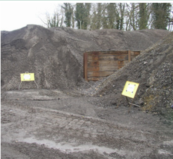
Figure 1 - Granulated slag for use in HBMs

A hydraulically bound mixture is a mixture of aggregate, water and hydraulic binder. Possible binders include cement, fly-ash, ground and/or granulated slag (see Figure 1), lime, pozzolan and combinations thereof. Binders can be generic or proprietary. HBM is one of the most commonly used materials in pavement sub-base layers where cement-treated bases or cement-bound materials have traditionally been used.