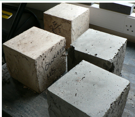
Figure 5 - HBM cubes and cylinders for testing