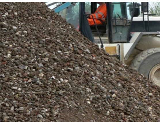
Figure 3 - Ungraded aggregate