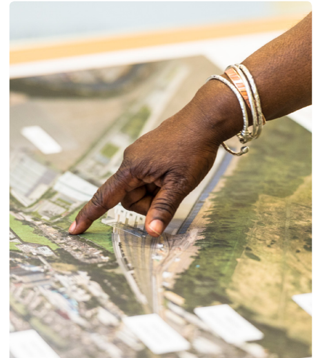
A series of community events accompany our environmental consultations

www.parliament.uk/about/how/committees/select