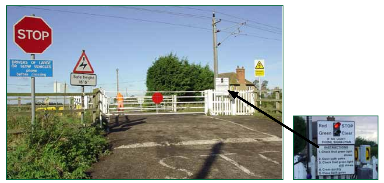
Figure 2: Example of a user worked crossing with miniature stop lights and telephones (Black Horse Drove, Cambridgeshire)

20 The concept of the private level crossing equipped with gates or barriers is a particular characteristic of railways in the UK (and Ireland). Elsewhere in the world, railways in rural areas are generally unfenced and level crossings that give access to private land are protected only by notices warning users to look out for approaching trains.