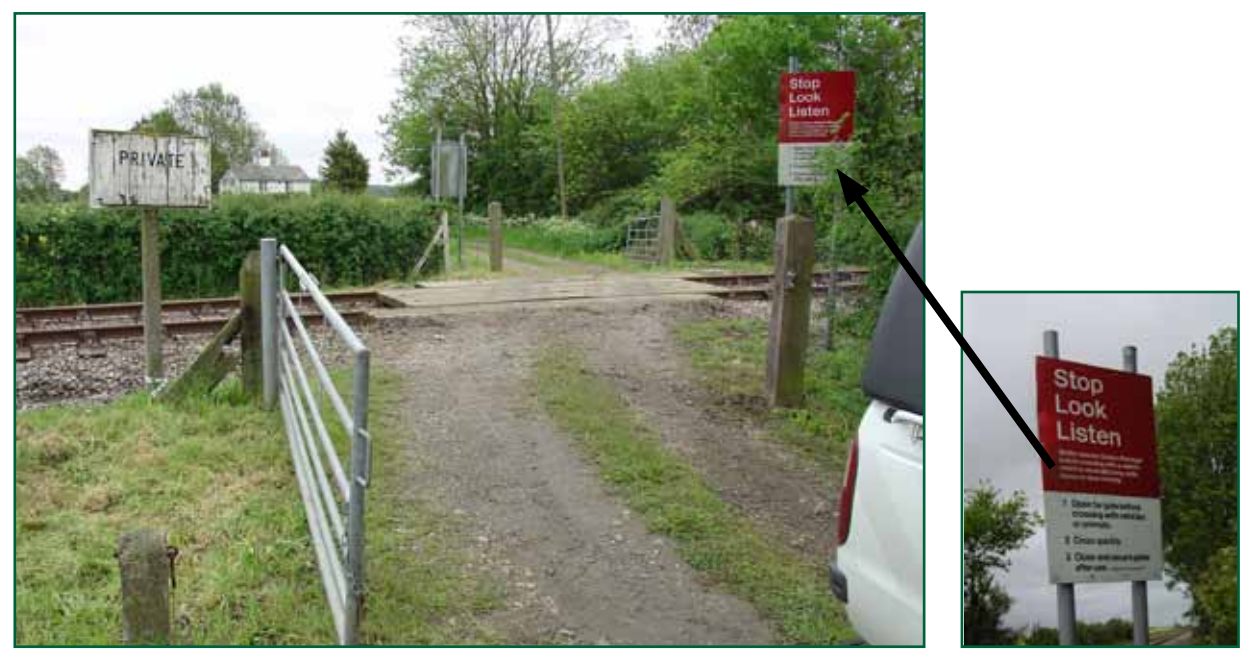
Figure 1: Example of a user worked crossing without additional protection (Bratts Blackhouse, Suffolk)