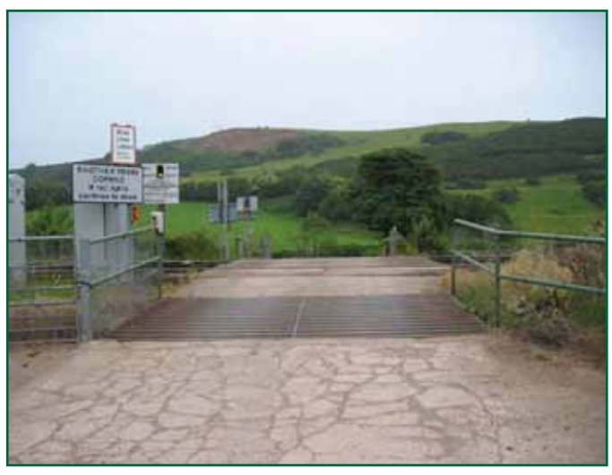
Figure 6: UWC with miniature stop lights, with gates removed (Network Rail)

175 Removal of the gates at crossings fitted with miniature stop lights has taken place at one crossing in Cumbria (Figure 6). This was at a location where the crossing was heavily used to gain access to industrial premises and farm buildings over the crossing. It was felt that there was no prospect of gates being used correctly, and that it would be safer to remove them and brief all the authorised users to pay attention to the miniature stop lights. However, the signage was not altered and this raises questions about the message given to an unfamiliar user.