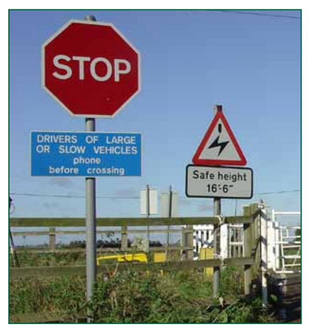
Figure 3: 'Stop' sign at UWC