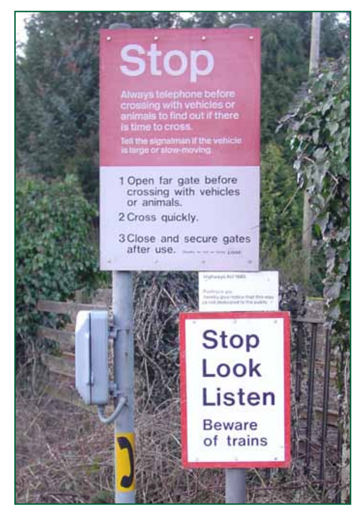
Figure 4: Signs and telephone at a UWC with a public footpath alongside it

171 There is considerable scope for review of the current law on signs, to make them more effective, coherent, comprehensible and accessible.