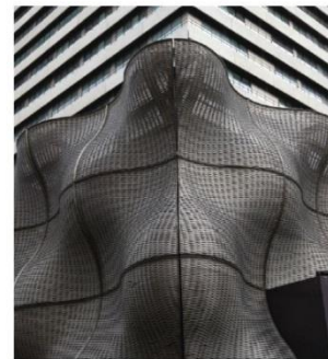
A sculptural response that enlivens the street scene and provides night time illumination