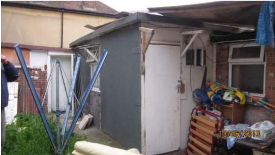
Exterior of outbuilding 2

The following actions were taken in relation to the three outbuildings at the property;