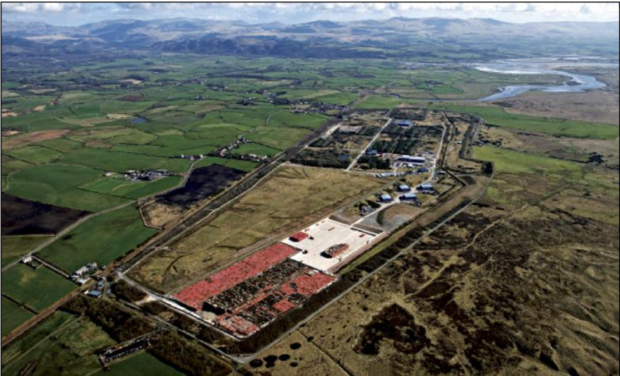
Figure 1 Aerial view of the LLWR in March 2011 viewed from the north-west

We authorised disposal of LLW into the trenches and Vault 8 under RSA 93. In 1999, we started a review of the RSA 93 authorisation for the LLWR. The operator at that time, BNFL, had not updated the impact assessment carried out in the 1980s by the National Radiological Protection Board (NRPB, currently part of the Public Health England (PHE)). Therefore, we could not assess the potential impact of the site from existing and future (predicted) disposals. Consequently, in January 2000 we varied (changed) the LLWR authorisation and required BNFL to provide information about the environmental safety of the LLWR during its operational lifetime (the operational environmental safety case (OESC)) and after its final closure (the post-closure safety case (PCSC)). BNFL submitted these two ESCs in September 2002 (BNFL 2002a and 2002b). Between 2002 and 2005 we carried out a detailed assessment of the safety cases (Environment Agency, 2005a). This raised a number of queries, many of which we recorded in issue assessment forms (IAFs 1 ).