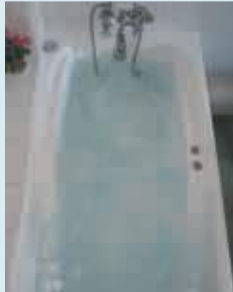
Whirlpool bath (by kind permission of Howard Cosling)