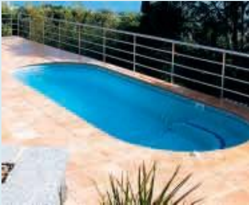
Swim spa (by kind permission of Spa De La Mare Ltd)