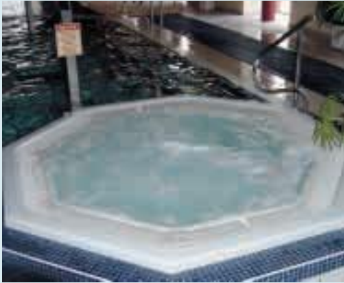
Commercial spa pool