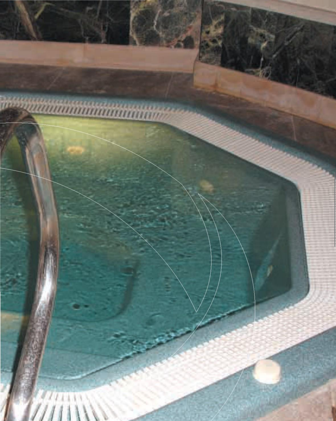
Commercial overflow/level deck spa pool