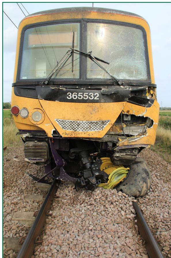
Figure 5: Debris under the front of train 1T60