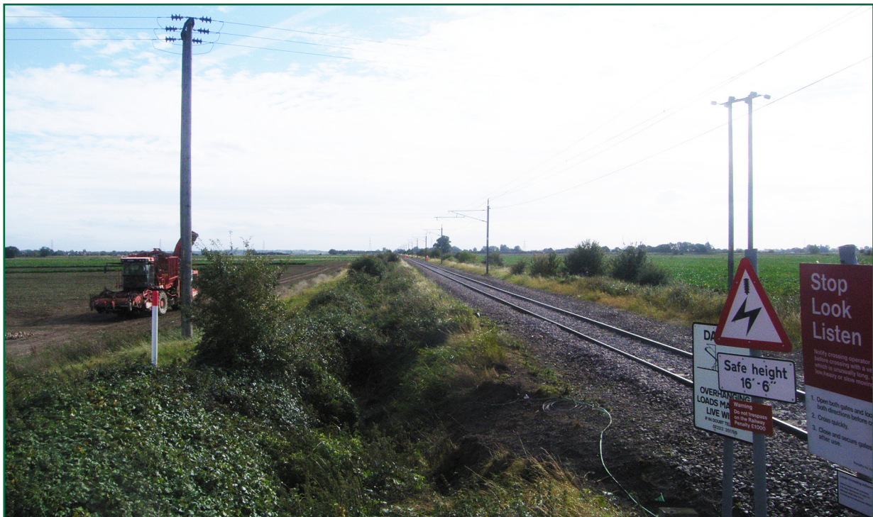
Figure 7: Sighting from White House Farm UWC towards Watlington at 5.8 metres from the nearer rail on the east side of the crossing from a height similar to that of a person sitting in a tractor. Sighting from a point further back would be significantly impaired by the vegetation to the left of the line.