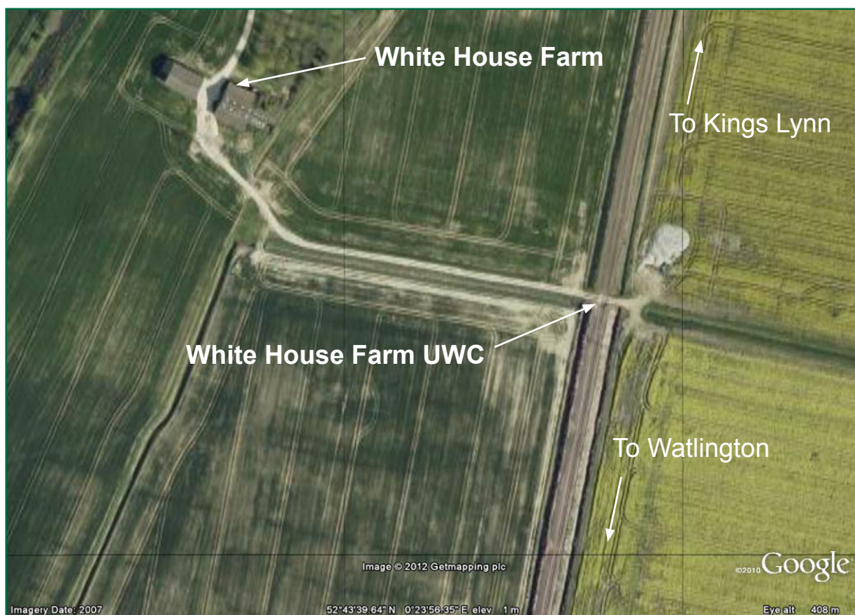
Figure 2: Google Earth image showing the location of White House Farm UWC