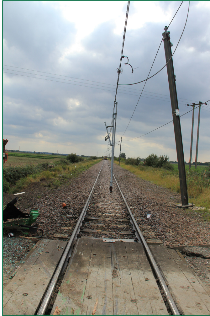
Figure 6: Damage to overhead line stanchion and equipment caused by counterweight from tractor