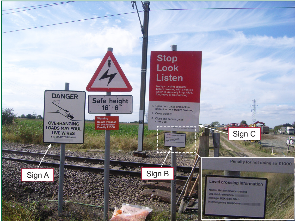
Figure 3: Signs at White House Farm UWC