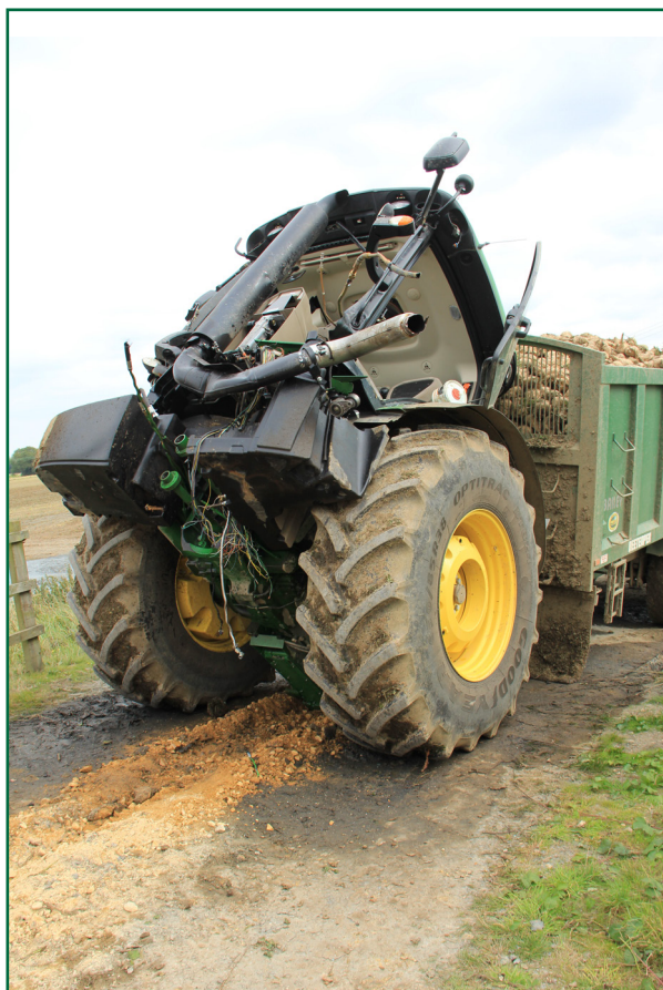
Figure 4: The cab section of the tractor (trailer still attached)