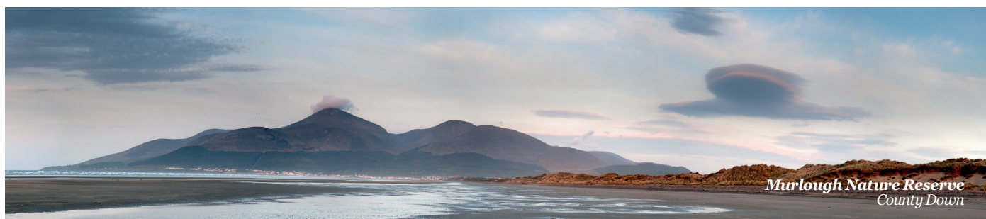
Murlough Nature Reserve County Down