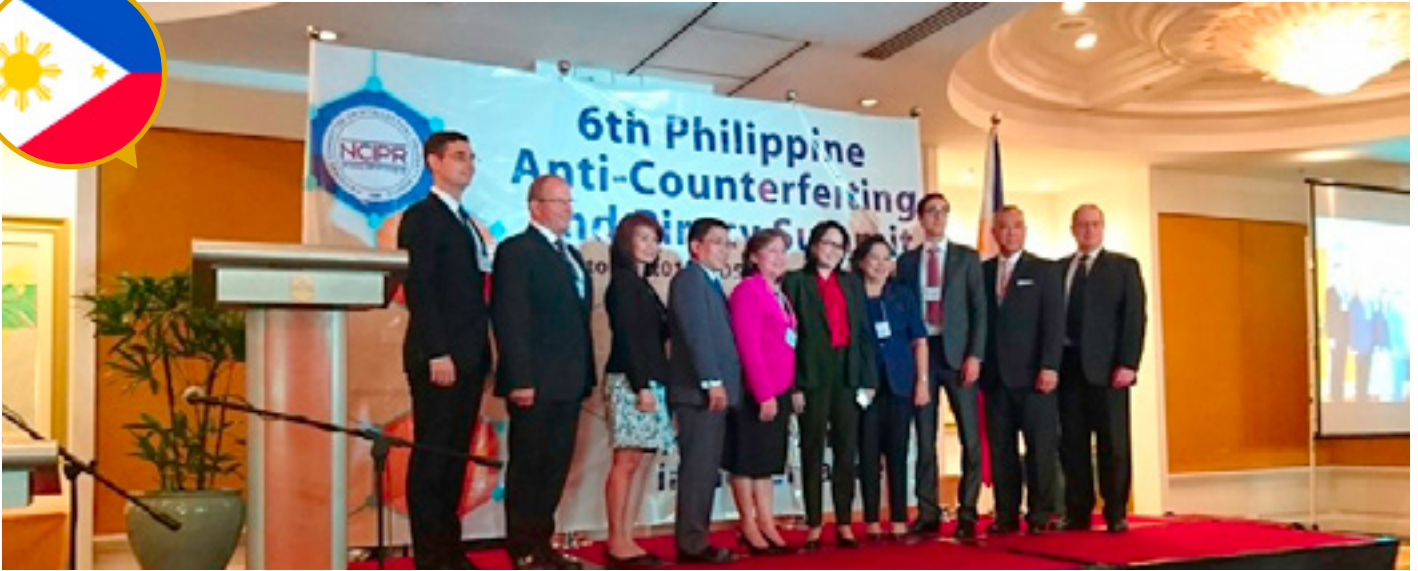
Speakers of the 6th IP Summit organised by IPO Philippines at EDSA Shangri-La in Manila.