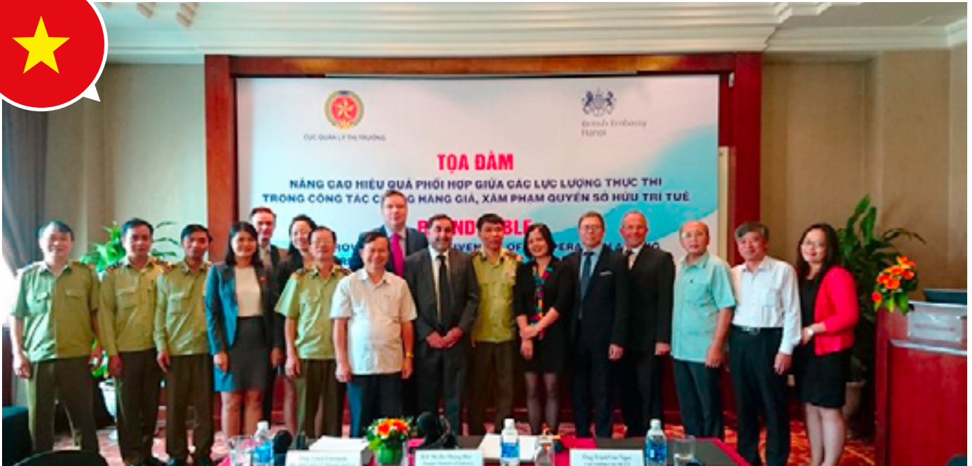
IPO delegation and British Embassy officials with members of Vietnam National Steering Committee 389 in Hanoi.