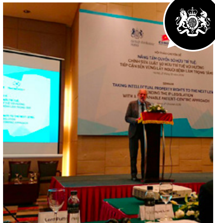
Lord Puttnam opening EuroCham Pharma Group IP Seminar at Pullman Hotel in Hanoi.

The visit coincided with the Prime Minister's Trade & Cultural Envoy Lord Puttnam's visit to the region during which he opened an inter-agency roundtable on IP enforcement in Hanoi and spoke at the EuroCham Pharma Group IP seminar in Hanoi.