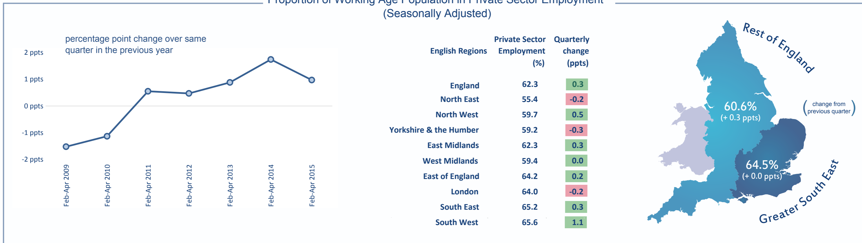
Proportion of Working Age Population in Private Sector Employment (Seasonally Adjusted)