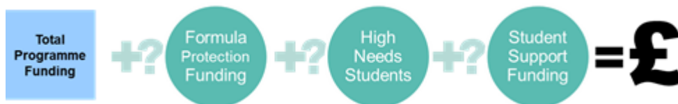
Figure 3: 16 to 19 Additional funding elements

There are also several additional funding elements that may or may not be relevant to your organisation: